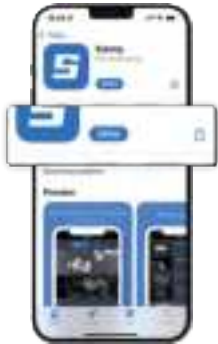
Download the APP

Download APP by Scanning the QR code according to the mobile phone system.