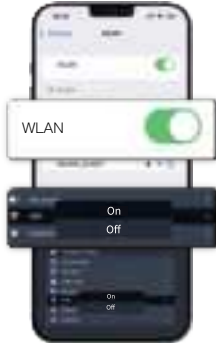
Turn on WiFi on XM and phone