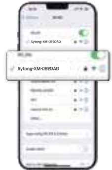
Choose WiFi "Sytong..." to connect WiFi (Password: 12345678 )