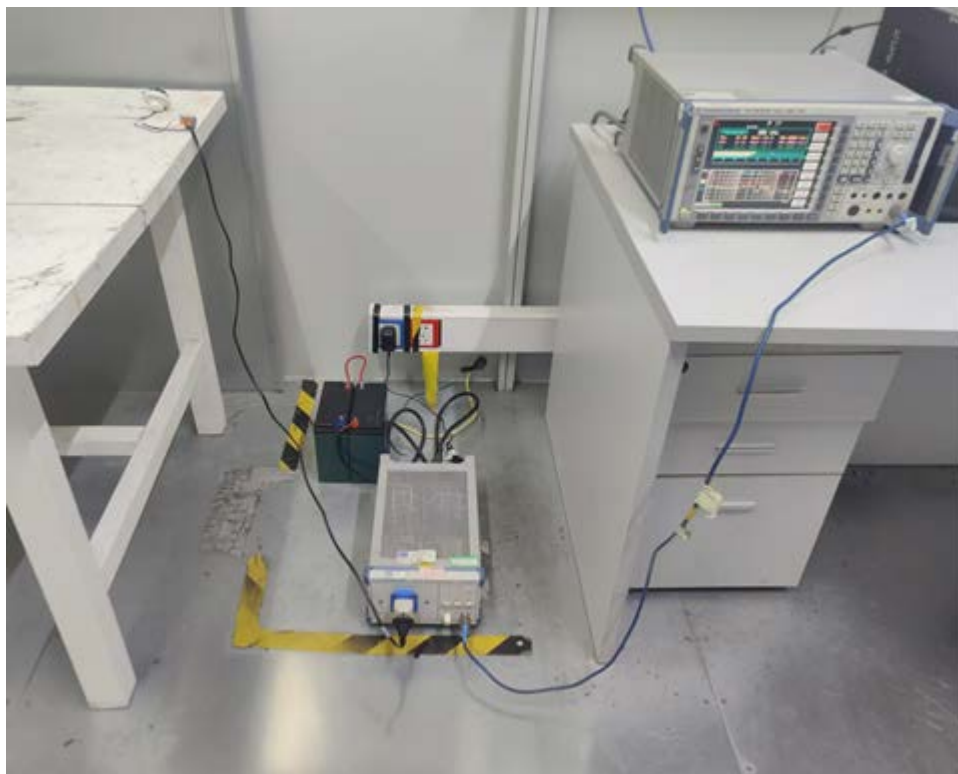
radiated emission test 30MHz – 1GHz