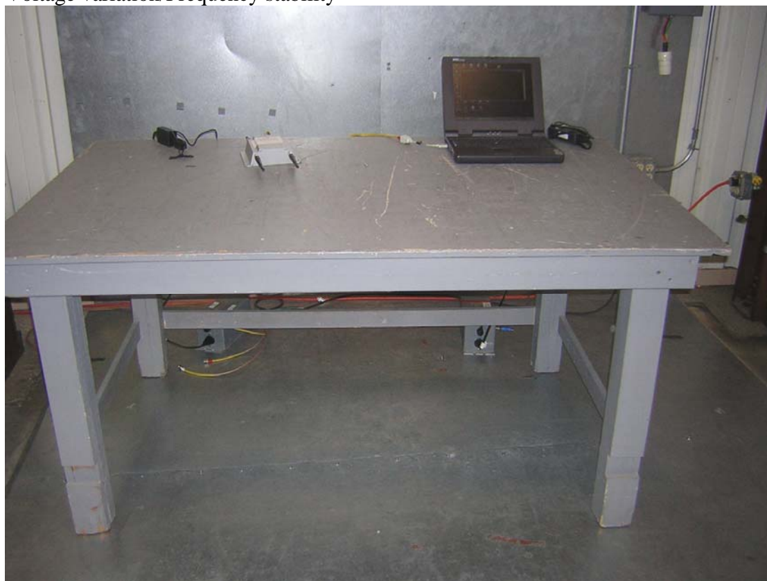
AC mains conducted emissions