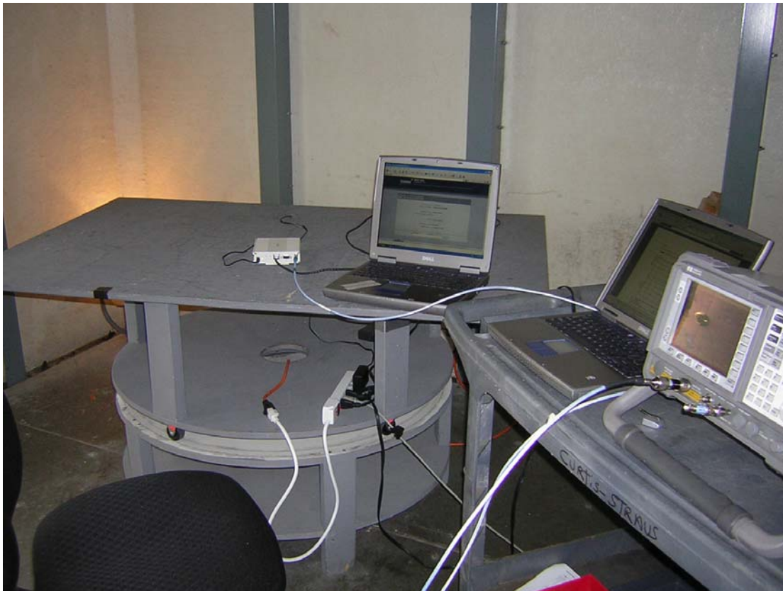
Conducted emissions at the antenna port