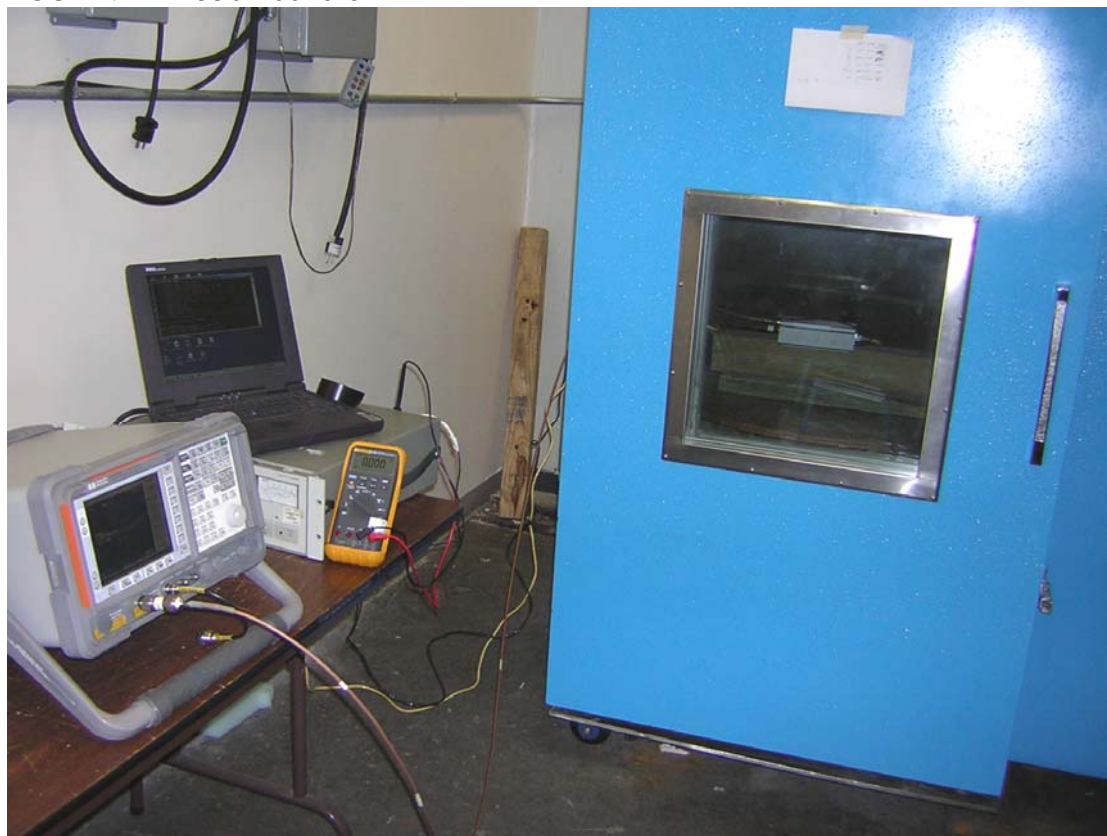
Voltage variation/Frequency stability