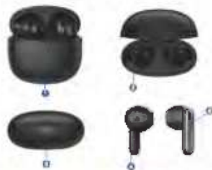
①Indicator light ②Charging status ③Type-C charging port ④Charging contacts ⑤Touch area