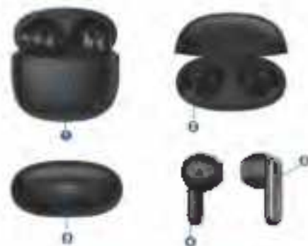
①指示灯 ②充电指示 ③Type-C充电口 ④充电触点 ⑤触控区域