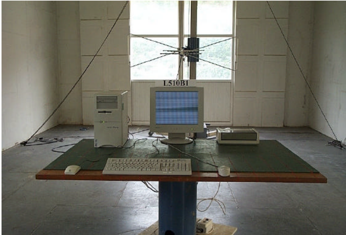
Radiated Emission 30MHz ~ 1000MHz