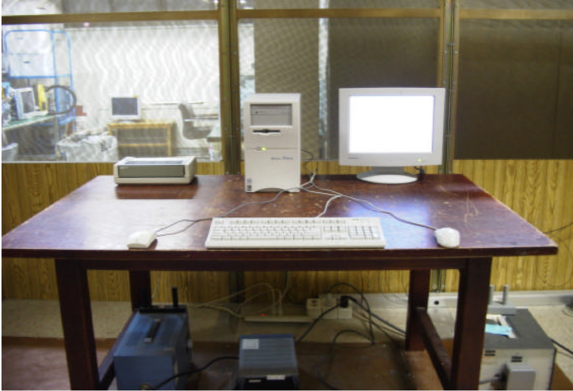
Conducted Emission 450kHz ~ 30MHz