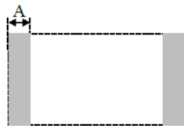
( Bottom View )