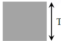
( Side View )