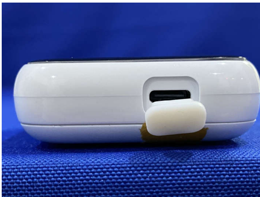
View of Product-9