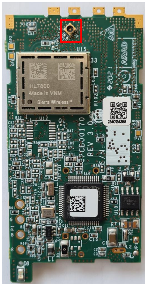
Original pcb'a (Rev 3):