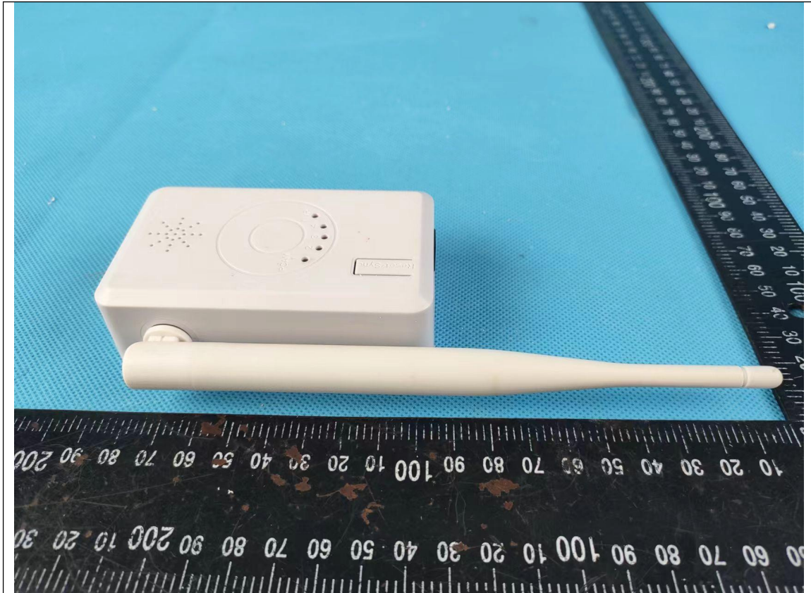
Antenna Bottom View [With Ruler]