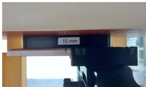
Photo of the device positioned for Body SAR measurement. The spacer was removed for the tests.

The device was placed in the SPEAG holder using the Microsoft spacer and placed below the flat phantom. The distance between the device and the phantom was kept at the separation distance indicated in the photo below using a separate flat spacer that was removed before the start of the measurements. The device was oriented with both sides facing the phantom to find the highest results.