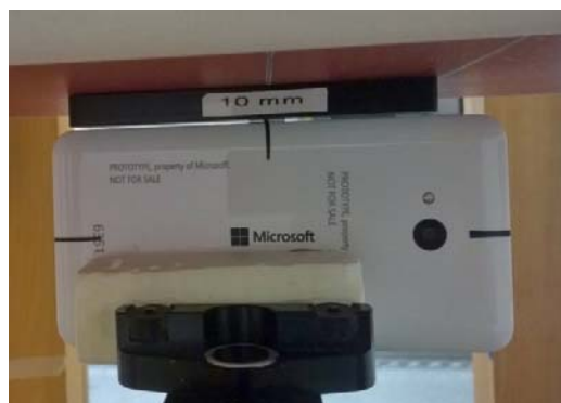
Photo of the device positioned for WR mode measurement – right edge facing phantom. The spacer was removed before the start of the measurements