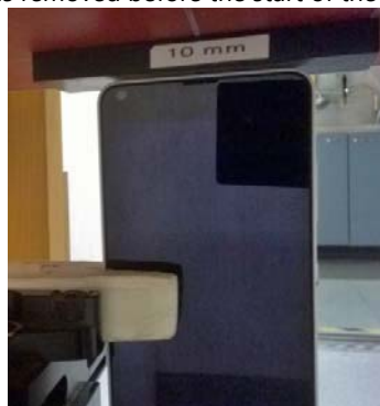
Photo of the device positioned for WR mode measurement – top edge facing phantom. The spacer was removed before the start of the measurements.