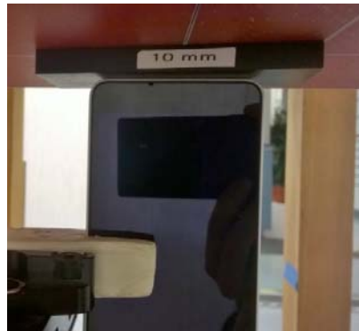
Photo of the device positioned for WR mode measurement – bottom edge facing phantom. The spacer was removed before the start of the measurements.