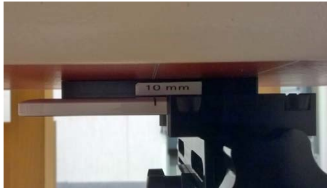
Photo of the device positioned for WR mode measurement –back facing phantom. The spacer was removed before the start of the measurements.

The device was placed in the SPEAG holder using the Microsoft spacer and, in sequence, the back, display and each of the 4 edges was positioned 10 mm away from the flat phantom. The spacer was removed before the start of the measurements.