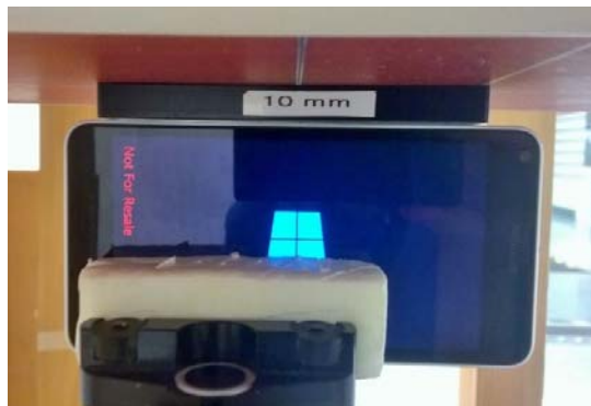
Photo of the device positioned for WR mode measurement – left edge facing phantom. The spacer was removed before the start of the measurements.