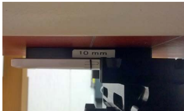
Photo of the device positioned for WR mode measurement – display facing phantom. The spacer was removed before the start of the measurements.