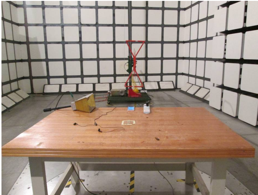
Radiated Emissions Rear View (30-1000 MHz)