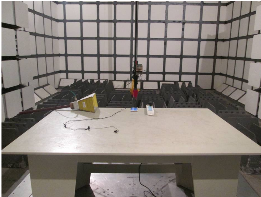
Radiated Emissions Rear View (1-25 GHz)