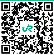
Scanning QR code UREVO APP