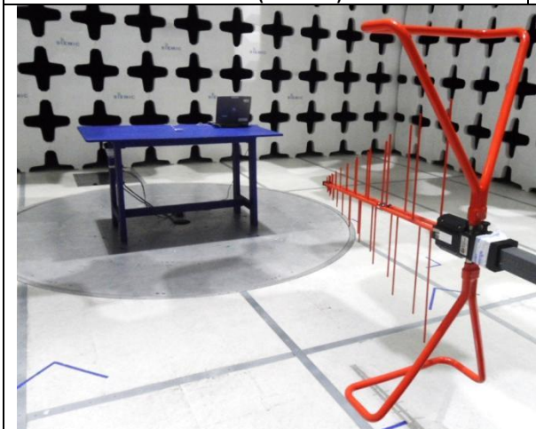
Radiated Emissions (30MHz-1GHz) – Front View