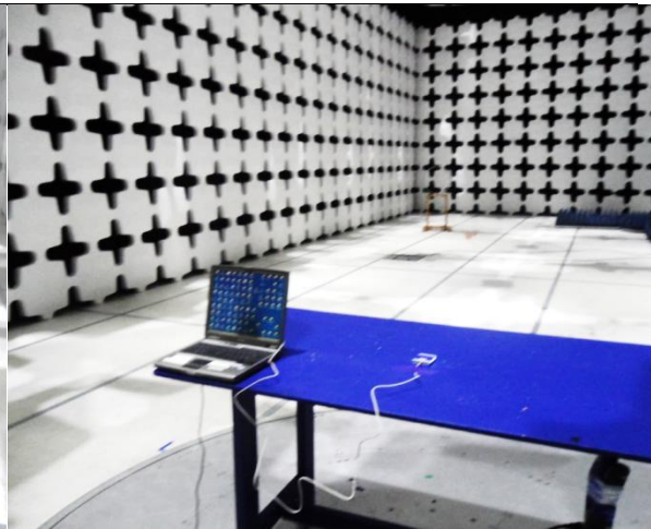
Radiated Emissions (<30MHz) – Rear View