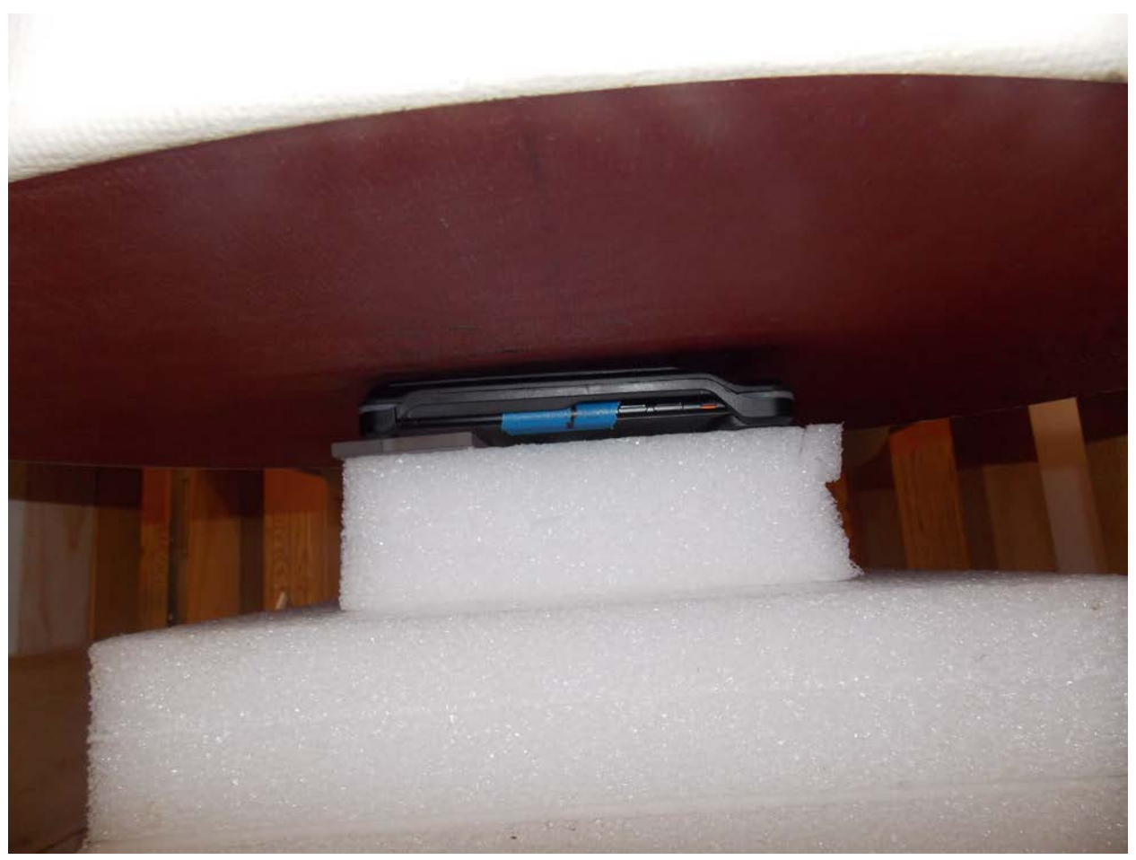
Body Back Configuration With Case 5 mm Gap