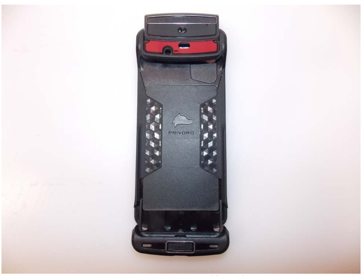
Front of Device (Case)