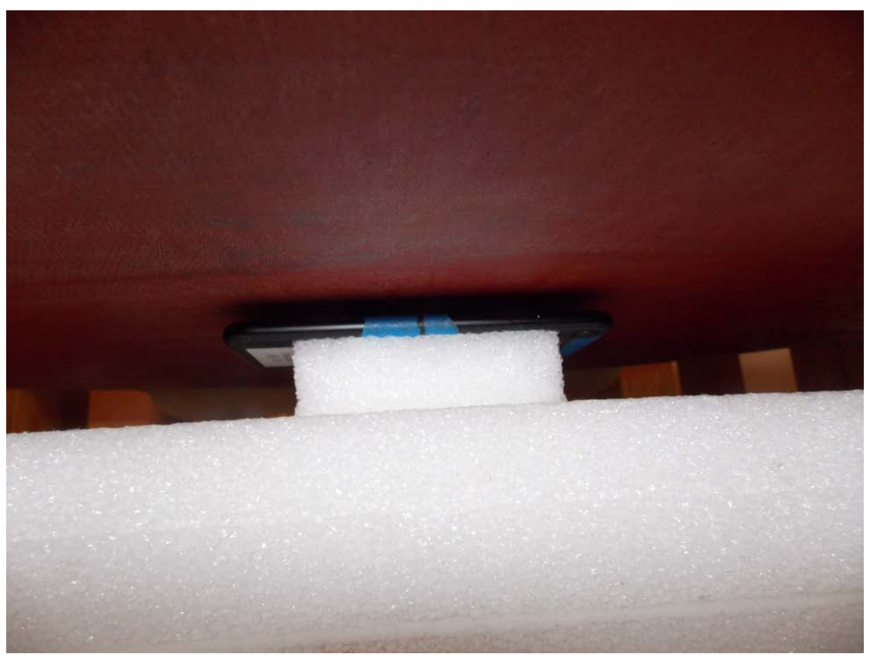
Body Front Configuration No Case 5 mm Gap