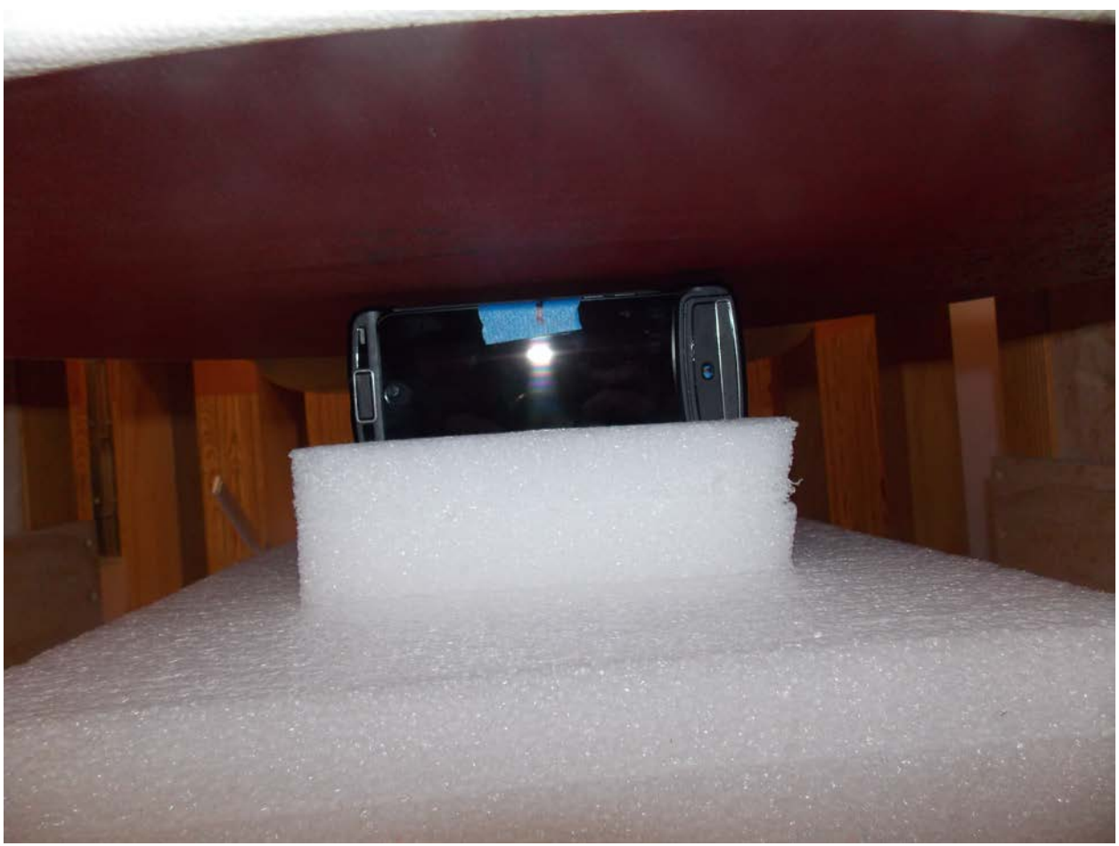
Body Left Configuration With Case 5 mm Gap