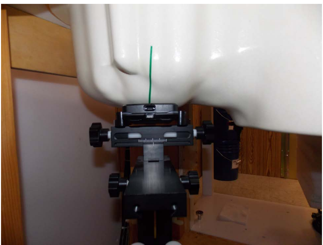
Right Touch With Case