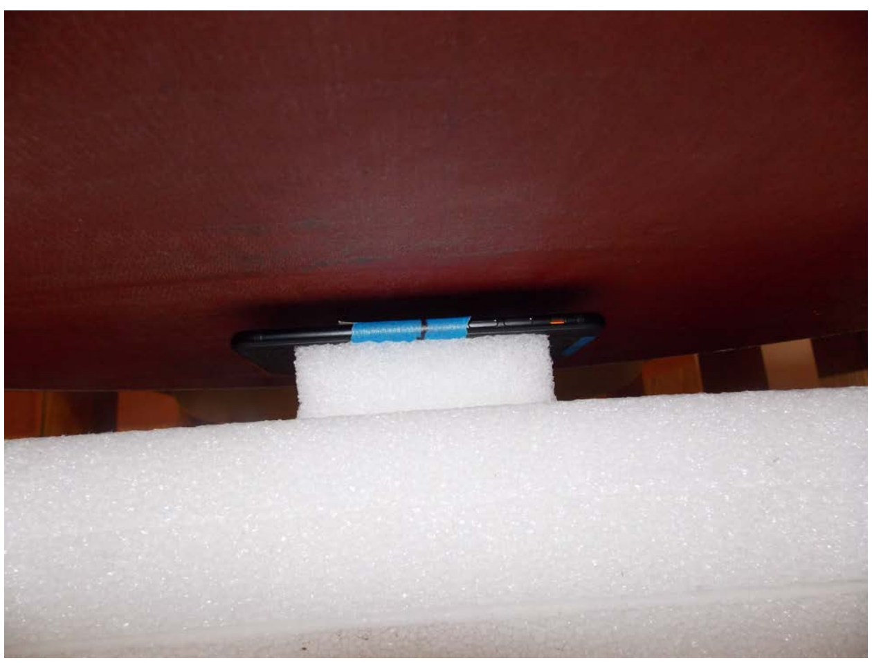
Body Back Configuration No Case 5 mm Gap