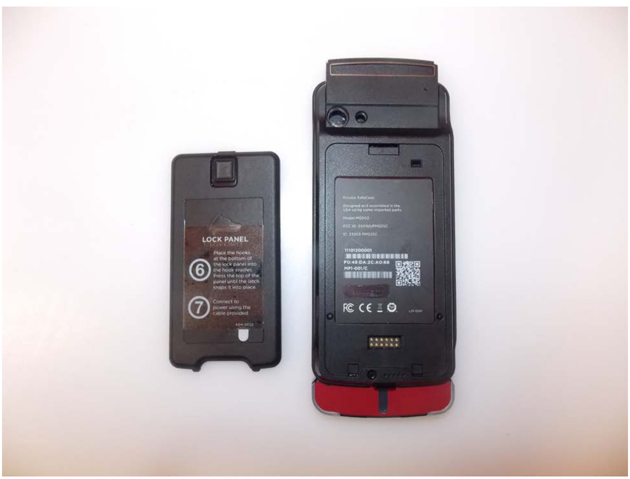
Back of Device (Case)