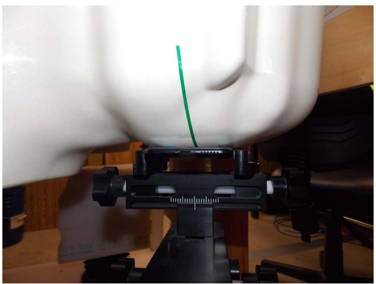
Left Touch No Case