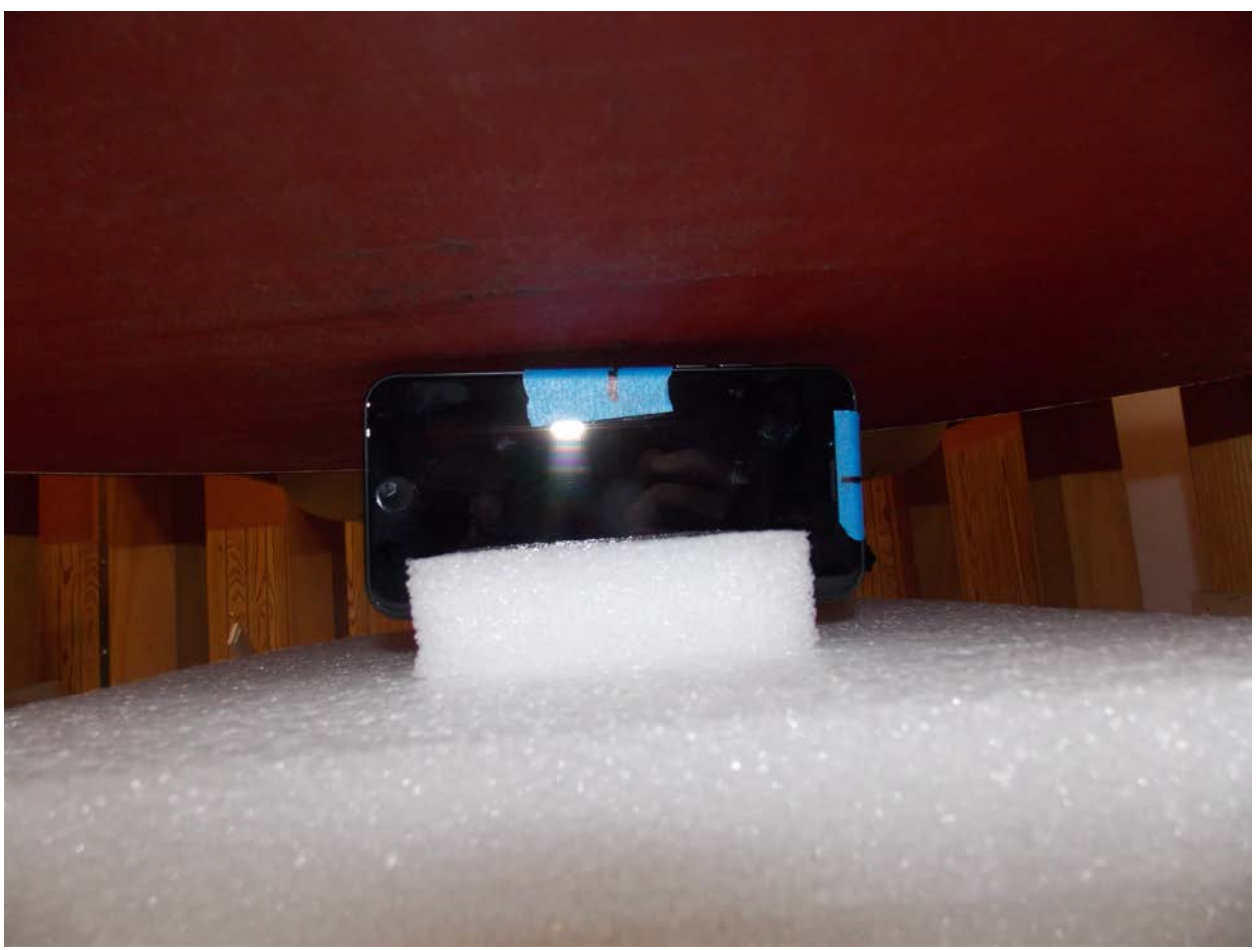
Body Left Configuration No Case 5 mm Gap