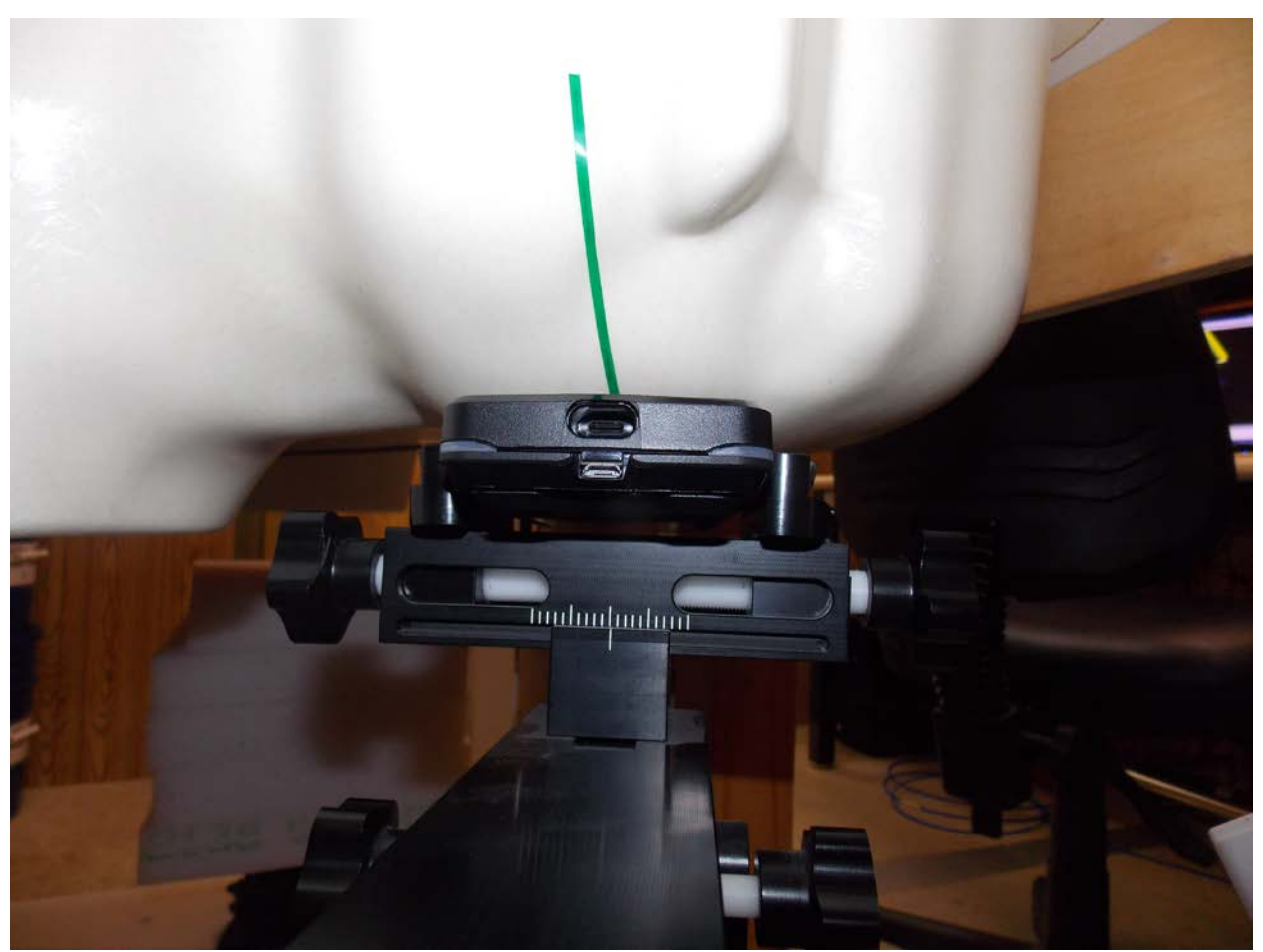
Left Touch With Case