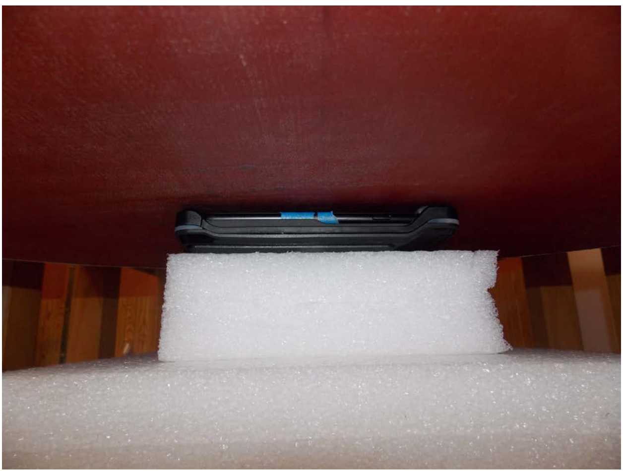
Body Front Configuration With Case 5 mm Gap