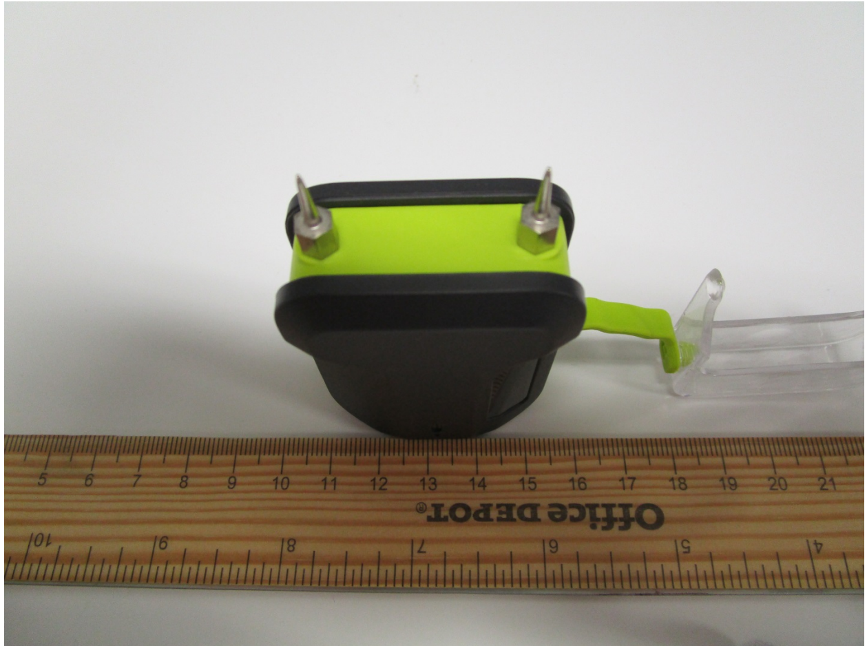
TOP VIEW WITHOUT COVER