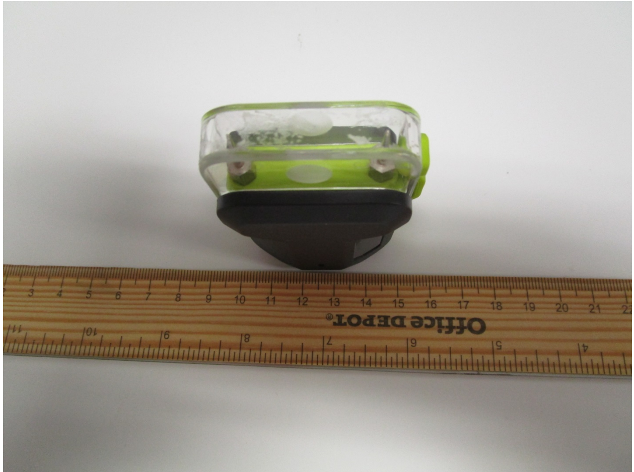
TOP VIEW WITH COVER