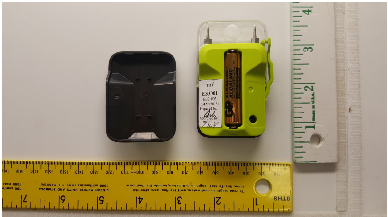
REAR VIEW WITH BACK COVER REMOVED