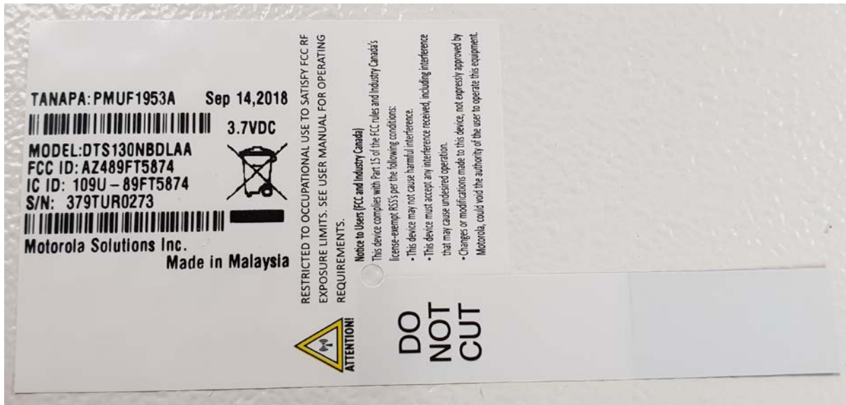
Figure 2: FCC/ IC Label for Sales model DTR 600