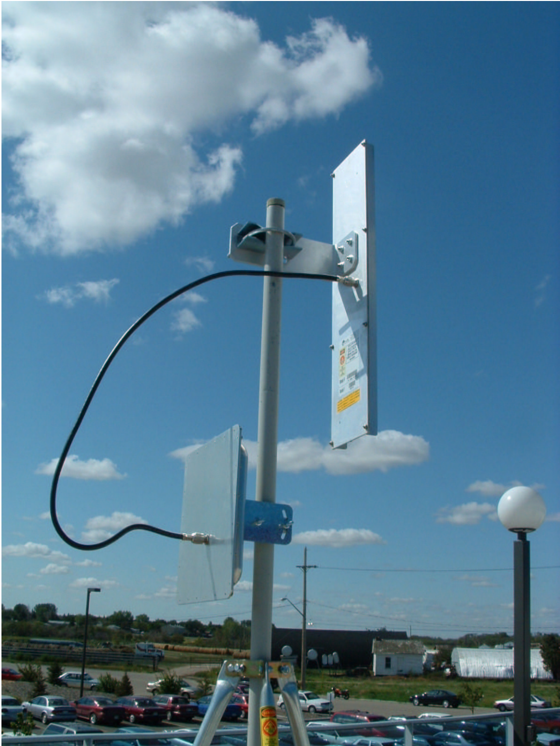
Antenna RF Exposure Label from 3 feet distance