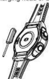
Schematic diagram of bracelet charging

Charge activation is required before using the watch for the first time; Use the equipped magnetic charger to attract the metal contacts on the back of the watch, and connect the other end of the charger to a USB charging head or a computer USB interface.