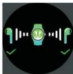
Schematic diagram of headset charging