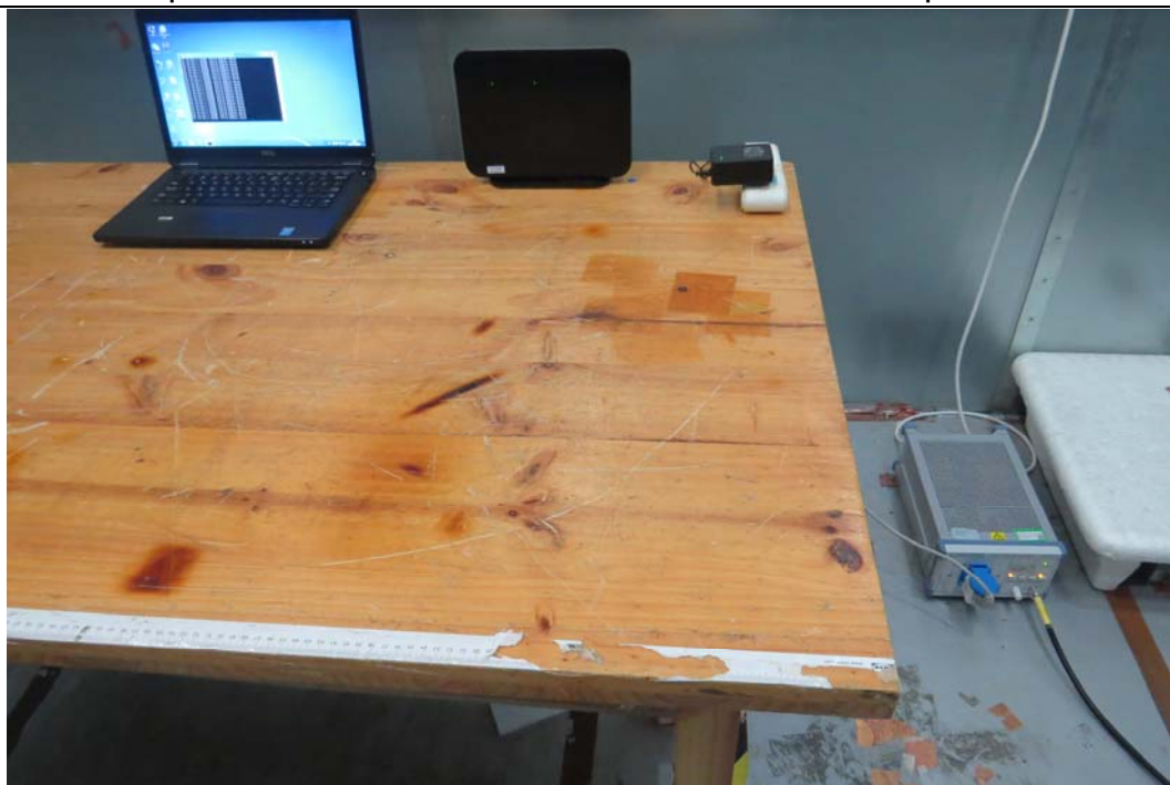
Picture 3 Conducted Emission Test Setup