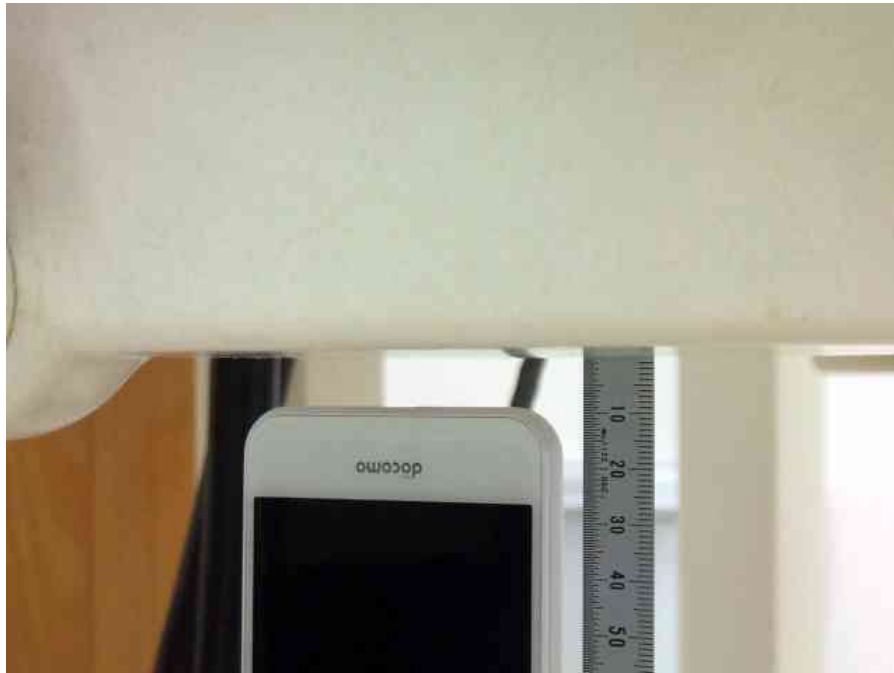
– Edge 3 (Bottom) –