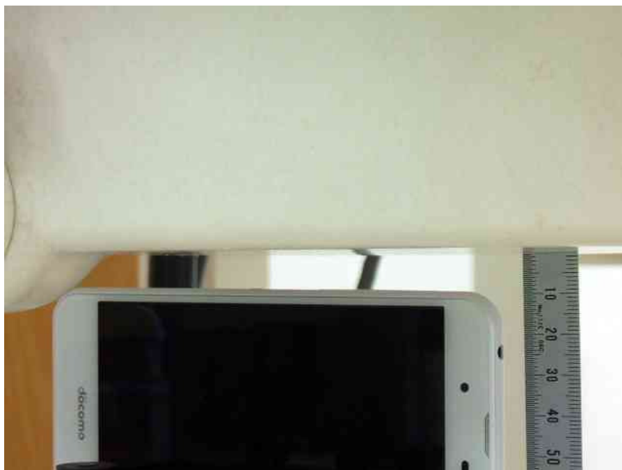
– Edge 4 (Left) –