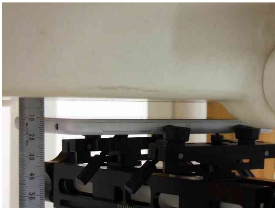
– Front –