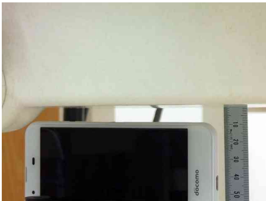
– Edge 2 (Right) –