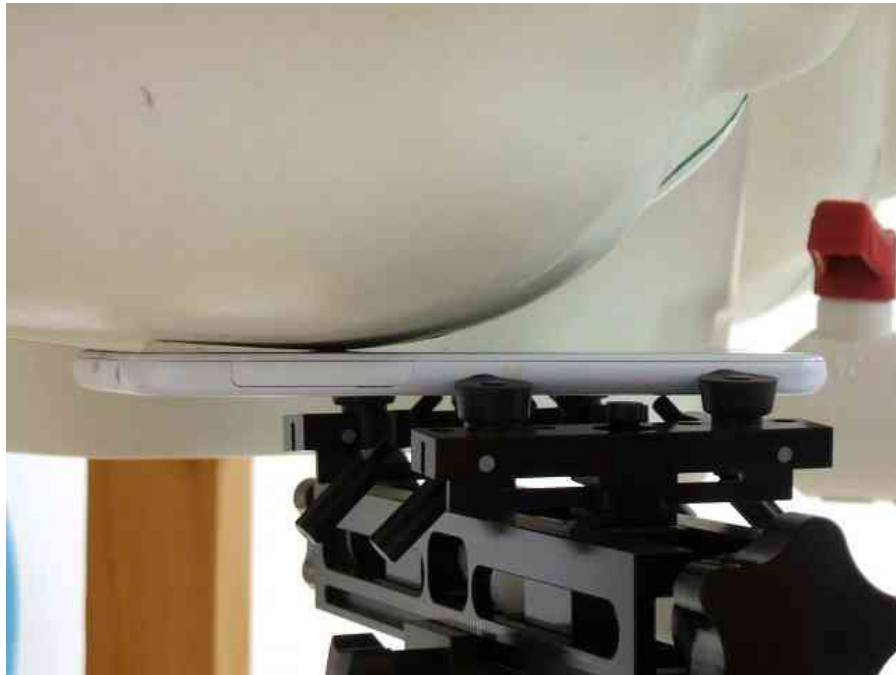
– Cheek-Touch Position –