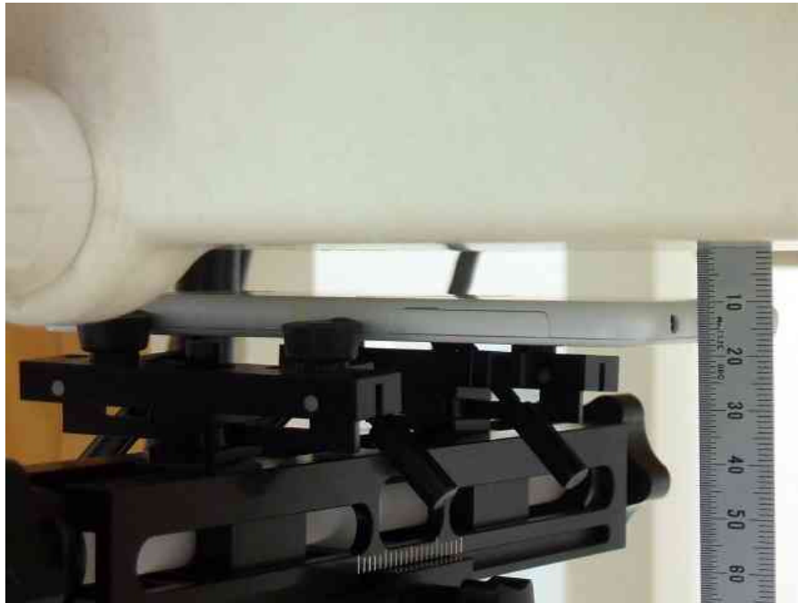
– Rear –