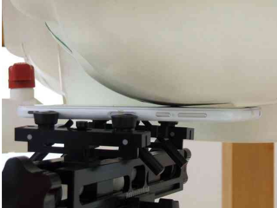
– Cheek-Touch Position –