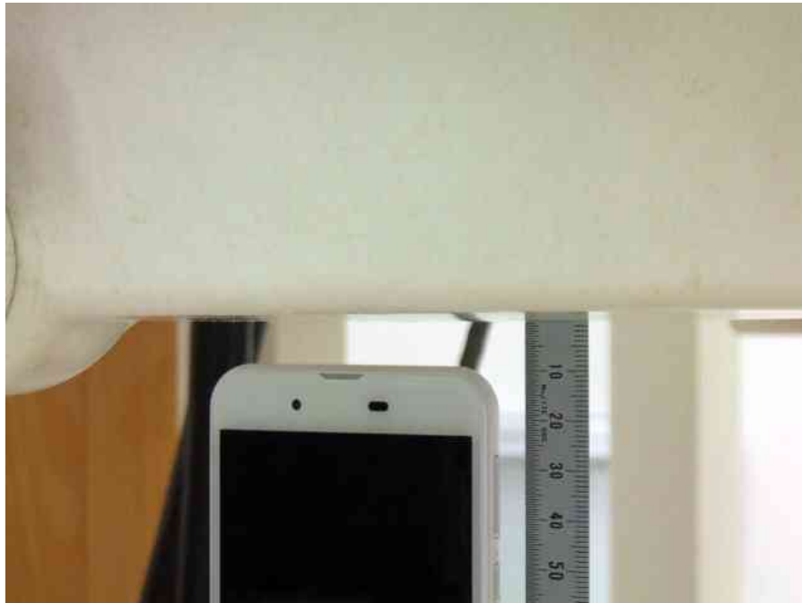
–Edge 1 (Top) –