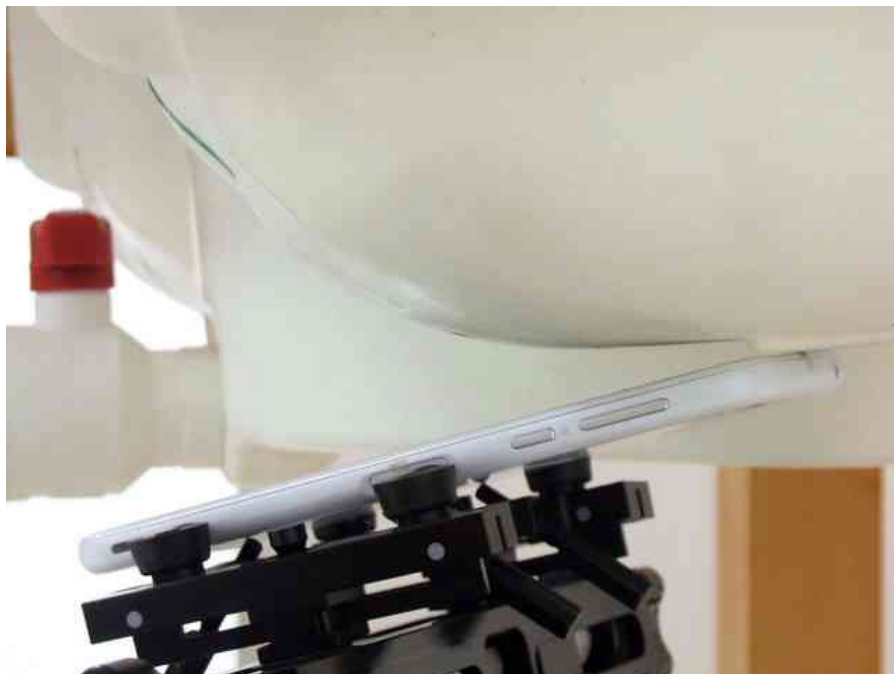
– Ear-Tilt Position –