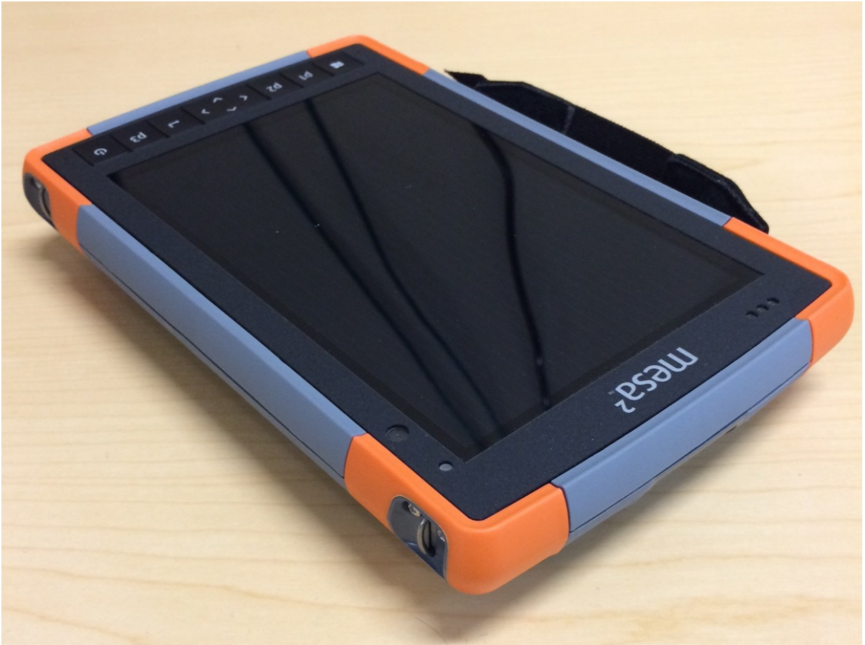
Figure 7: EUT – View 7