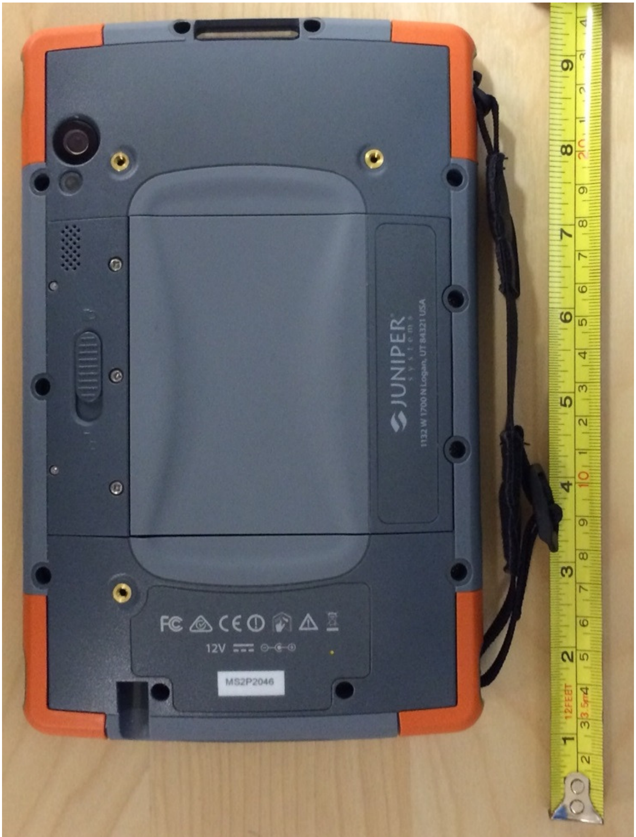
Figure 1: EUT – View 1