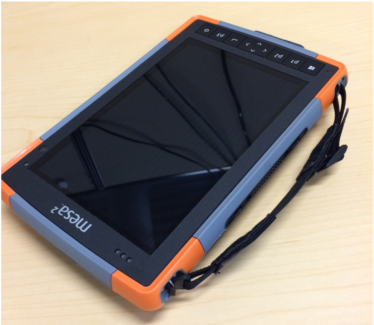
Figure 8: EUT – View 8