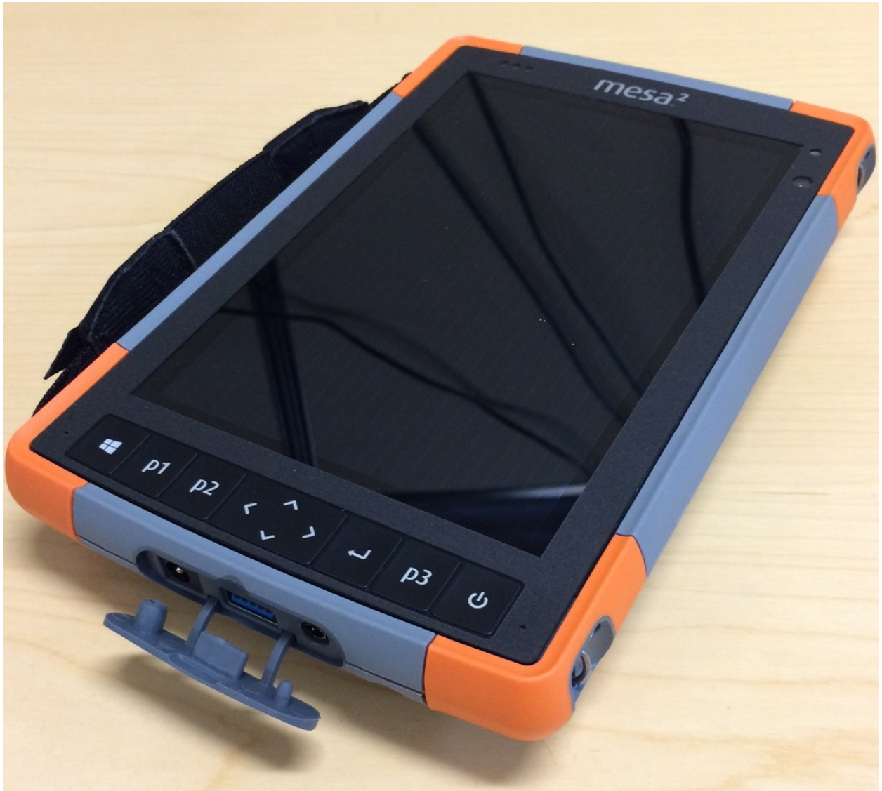
Figure 6: EUT – View 6