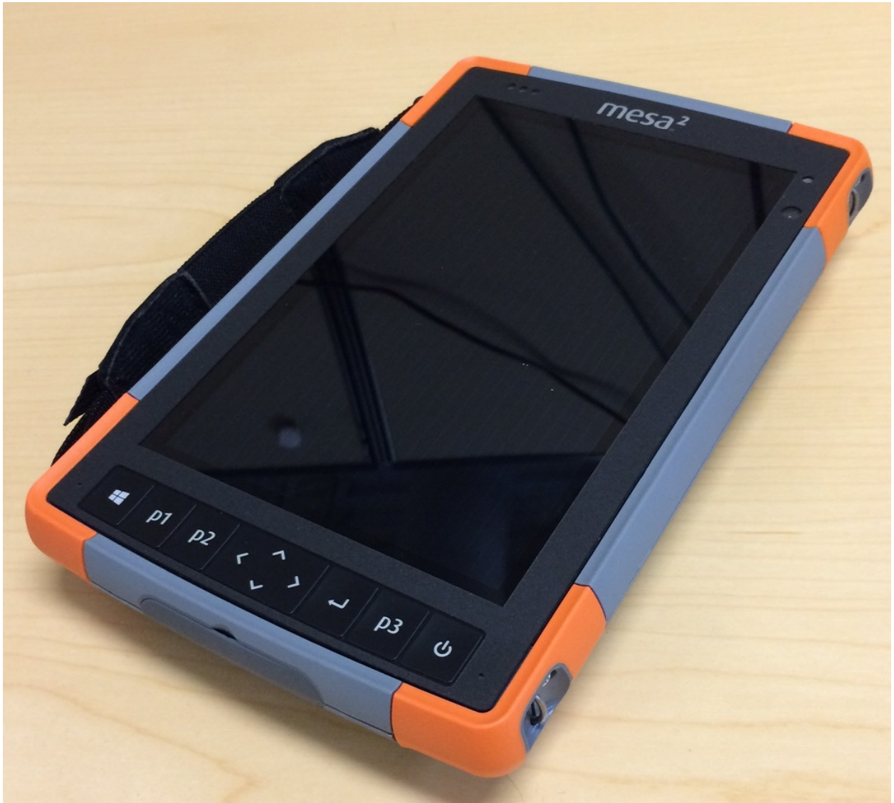
Figure 5: EUT – View 5