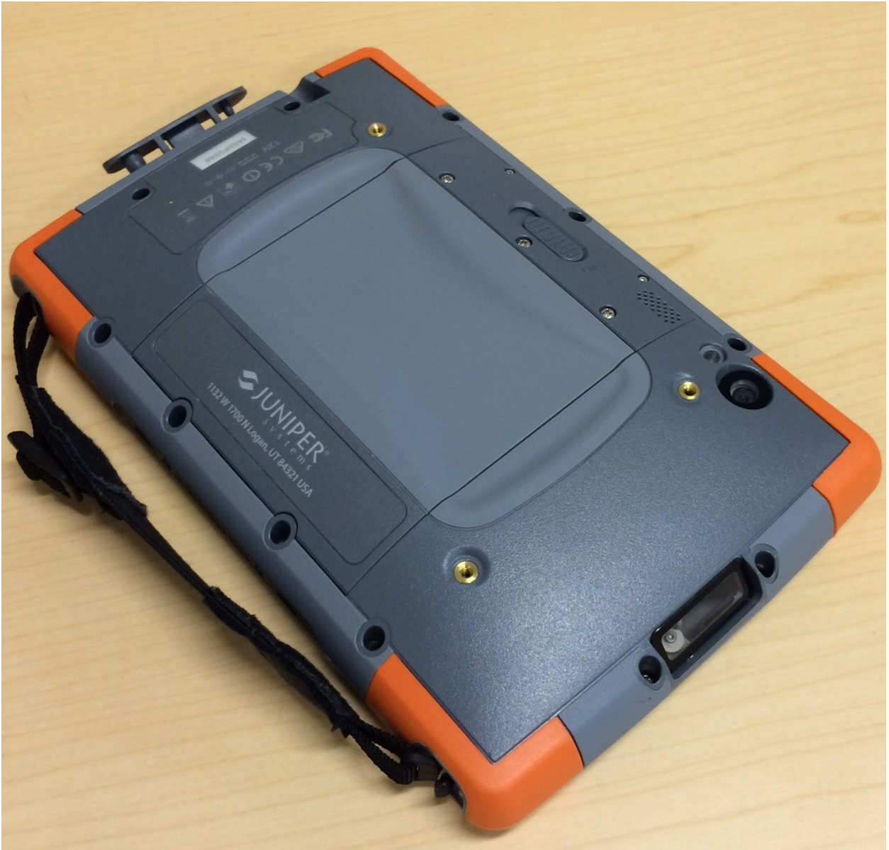
Figure 3: EUT – View 3