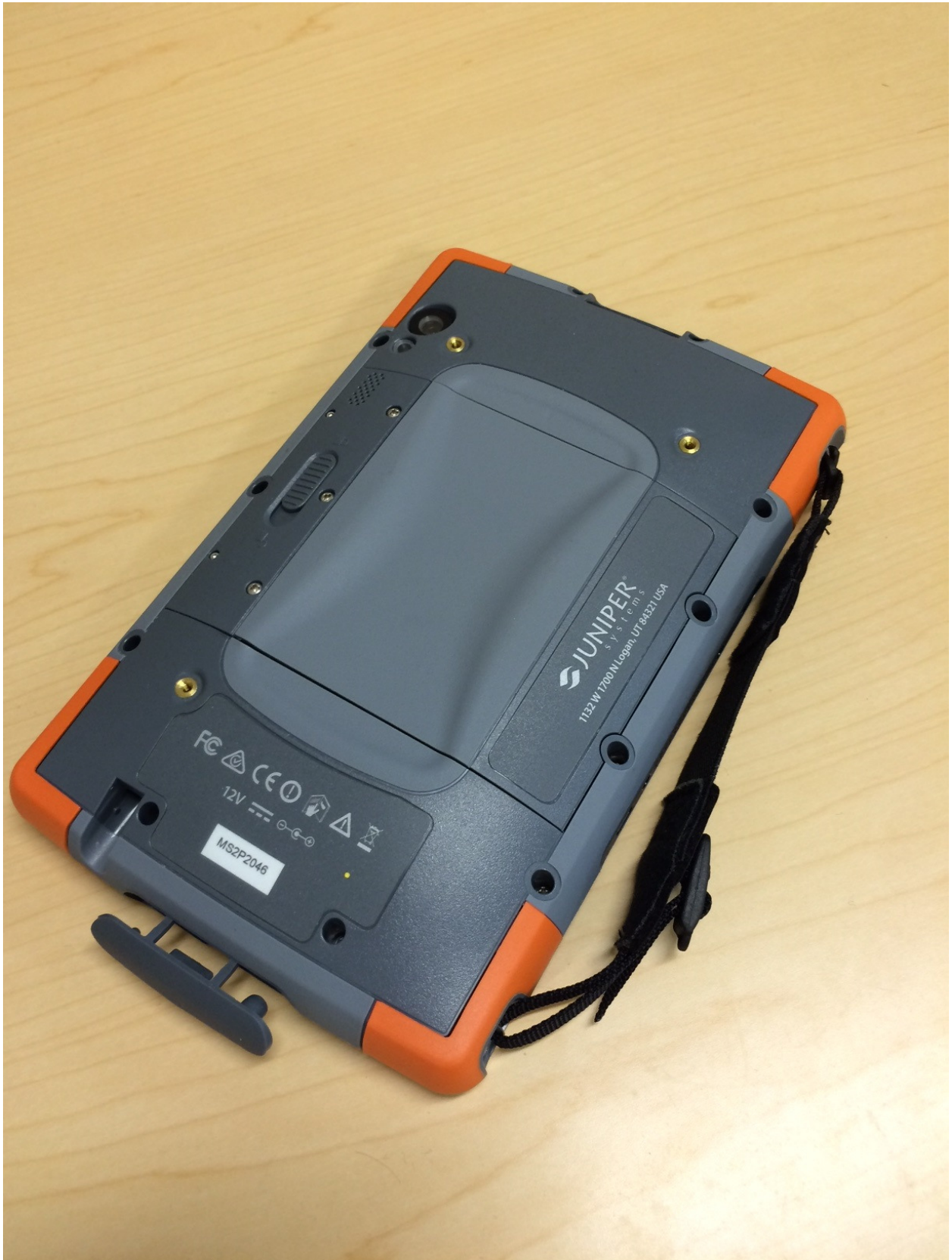
Figure 2: EUT – View 2