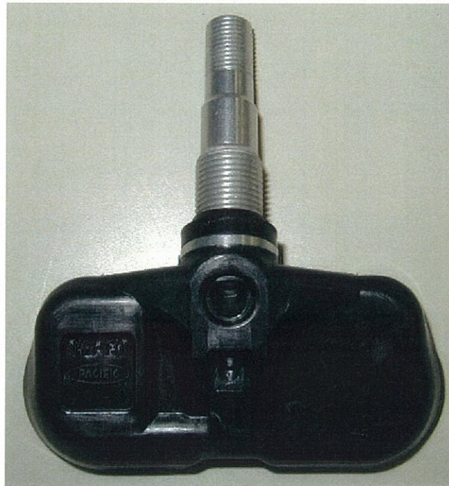
Bottom view of Transmitter