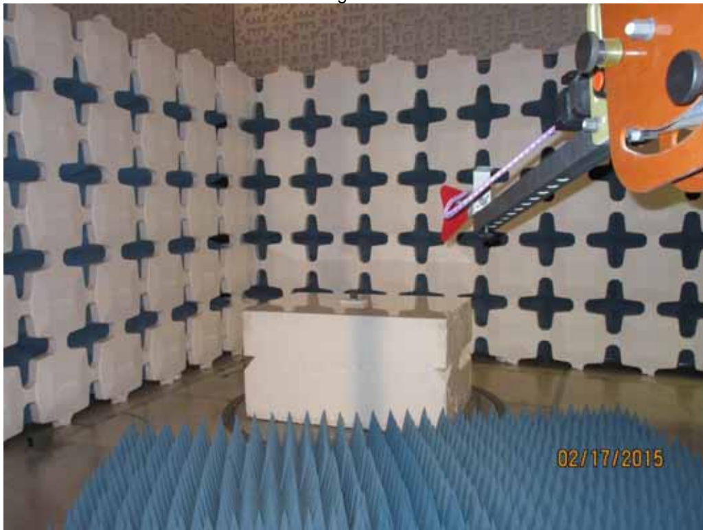
3522 Test Setup for Radiated Emissions, 1GHz to 5GHz – Horizontal Polarization