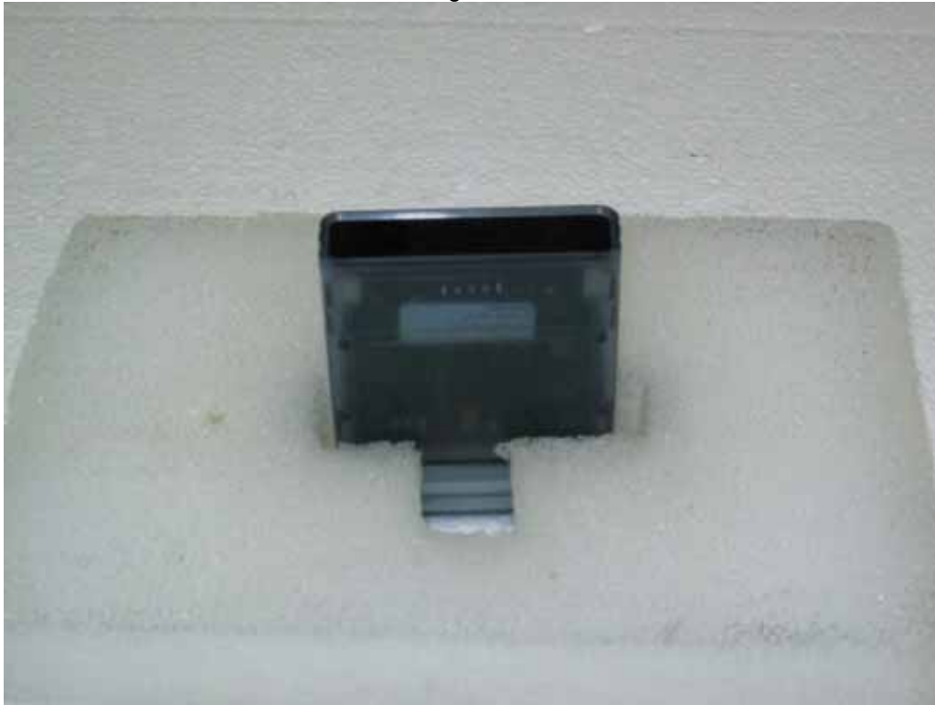
Test Setup for Radiated Emissions, 3520