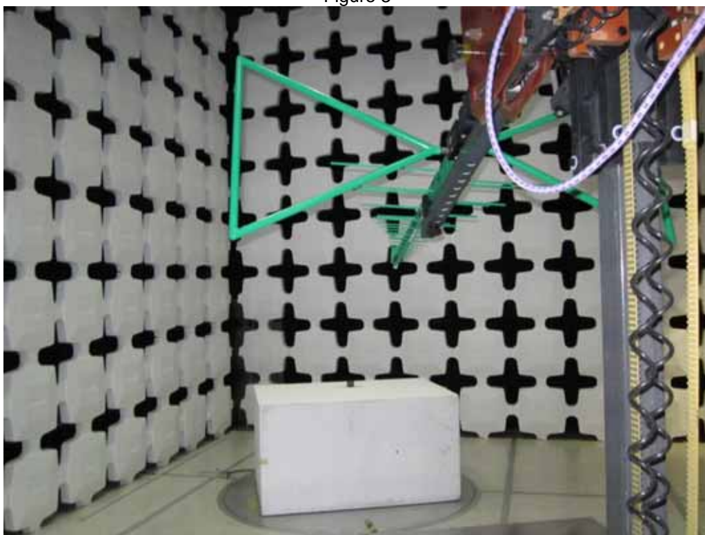
3520 Test Setup for Radiated Emissions, 30MHz to 1GHz – Horizontal Polarization