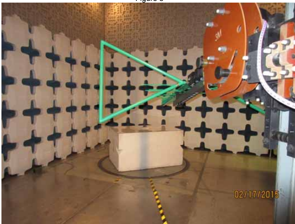
3522 Test Setup for Radiated Emissions, 30MHz to 1GHz – Horizontal Polarization