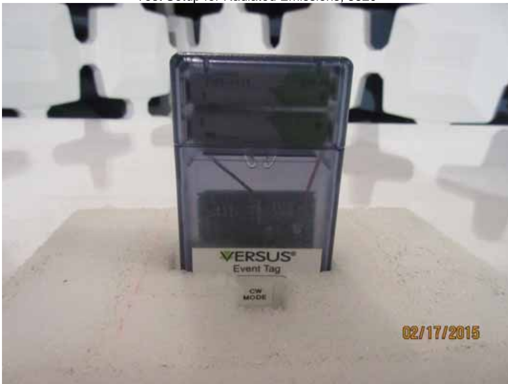
Test Setup for Radiated Emissions, 3522