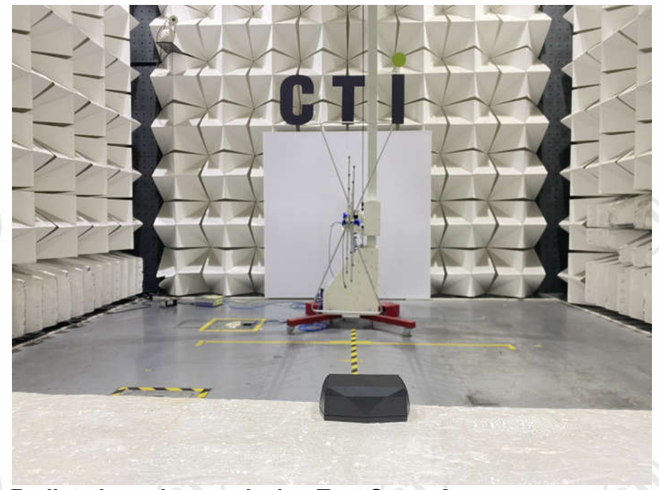
Radiated spurious emission Test Setup-2(Below 1GHz) close up