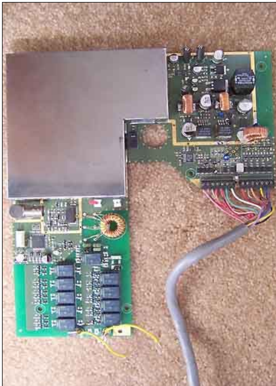
PCB Top - RF Shield Installed