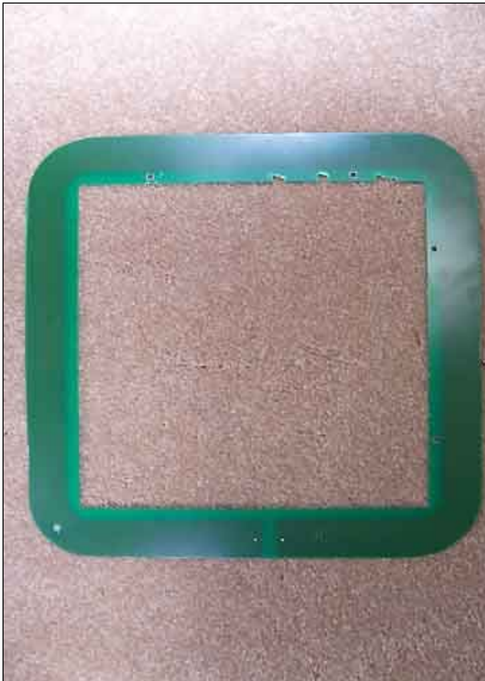
Antenna PCB Back