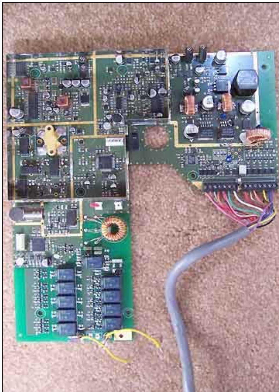
PCB Top - RF Shield Removed