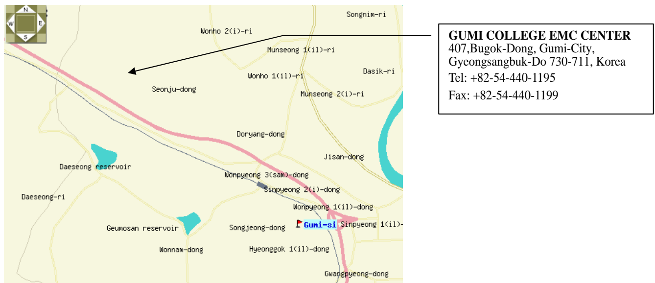
Fig 1. The map above shows the Gumi College in vicinity area.

This test site is one of the highest point of Gumi 1 college at about 200 kilometers away from Seoul city and 40 kilometers away from Daegu city. It is located in the valley surrounded by mountains in all directions where ambient radio signal conditions are quiet and a favorable area to measure the radio frequency interference on open field test site for the computing and ISM devices manufactures. The detailed description of the measurement facility was found to be in compliance with the requirements of §2.948 according to ANSI C63.4 on October 19, 1992