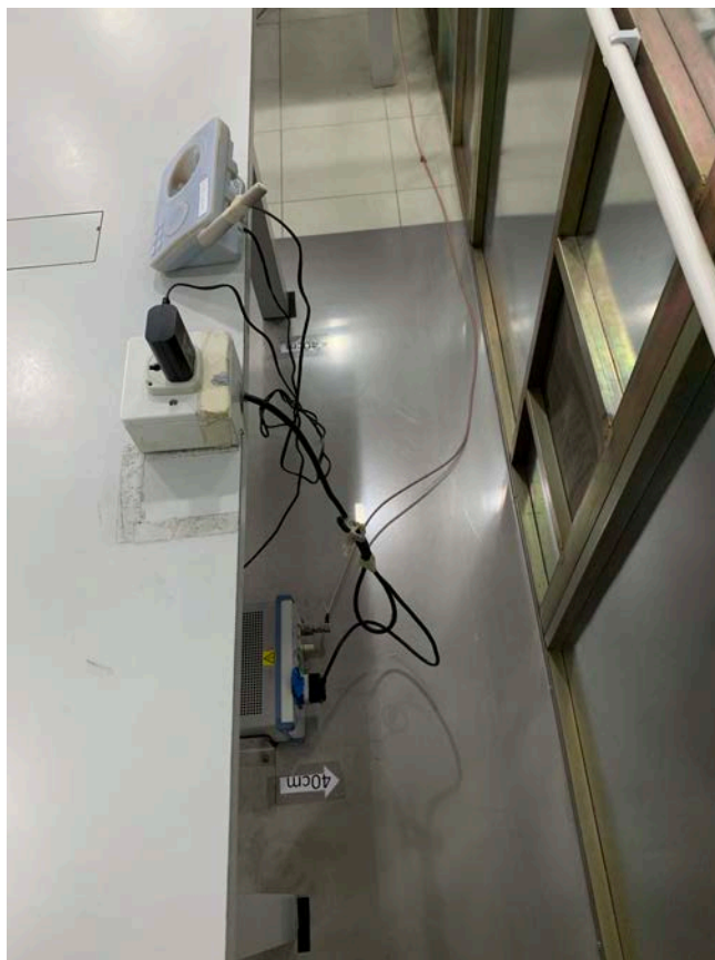
Side View 2