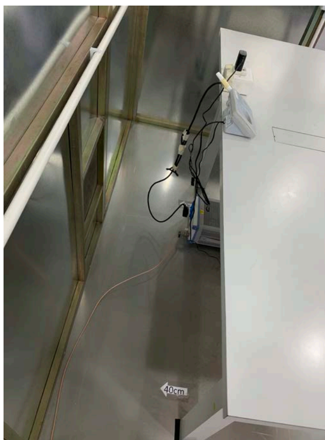
Side View 1