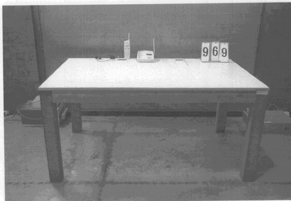
Fig. 4 Conducted emissions test placement (operating only)