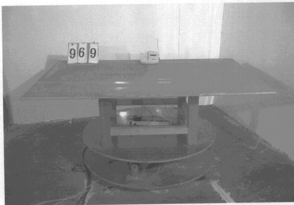
Pig 1 Front View of the Test Configuration ( BASE )