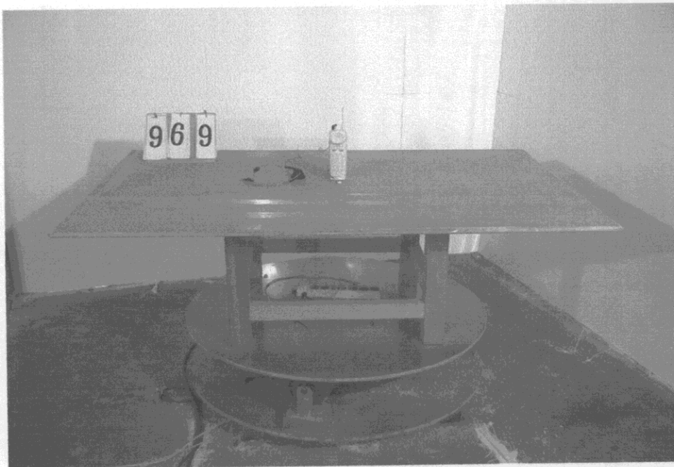
Pig 1 Front View of the Test Configuration (HANDSET)