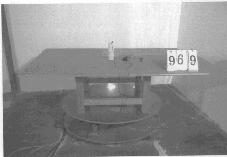
Pig 2 Rear View of the Test Configuration (HANDSET)

The test configuration for frequency between 1 GHz to 18 GHz is same as above.