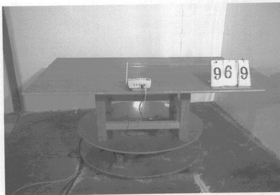
Pig 2 Rear View of the Test Configuration ( BASE )