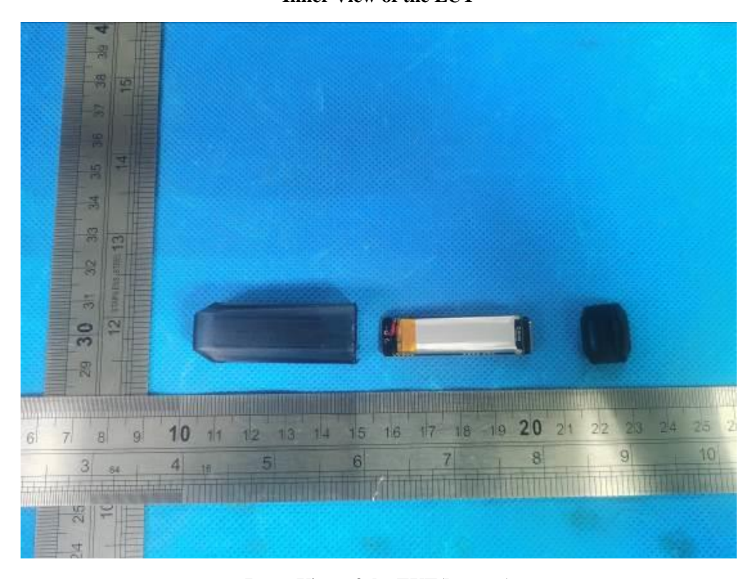
Inner View of the EUT(battery)