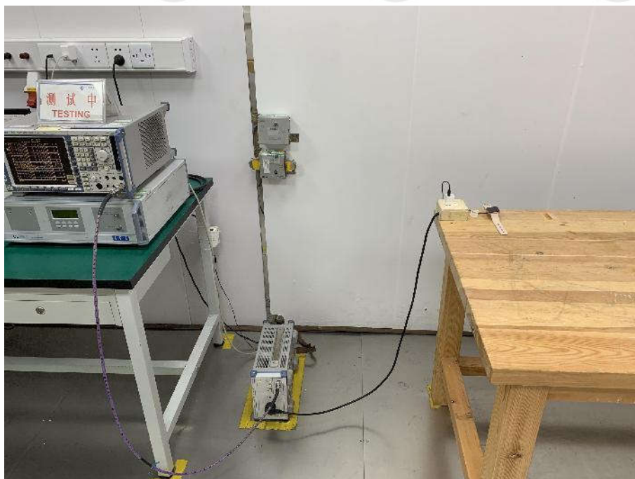
AC Power Line Conducted Emission