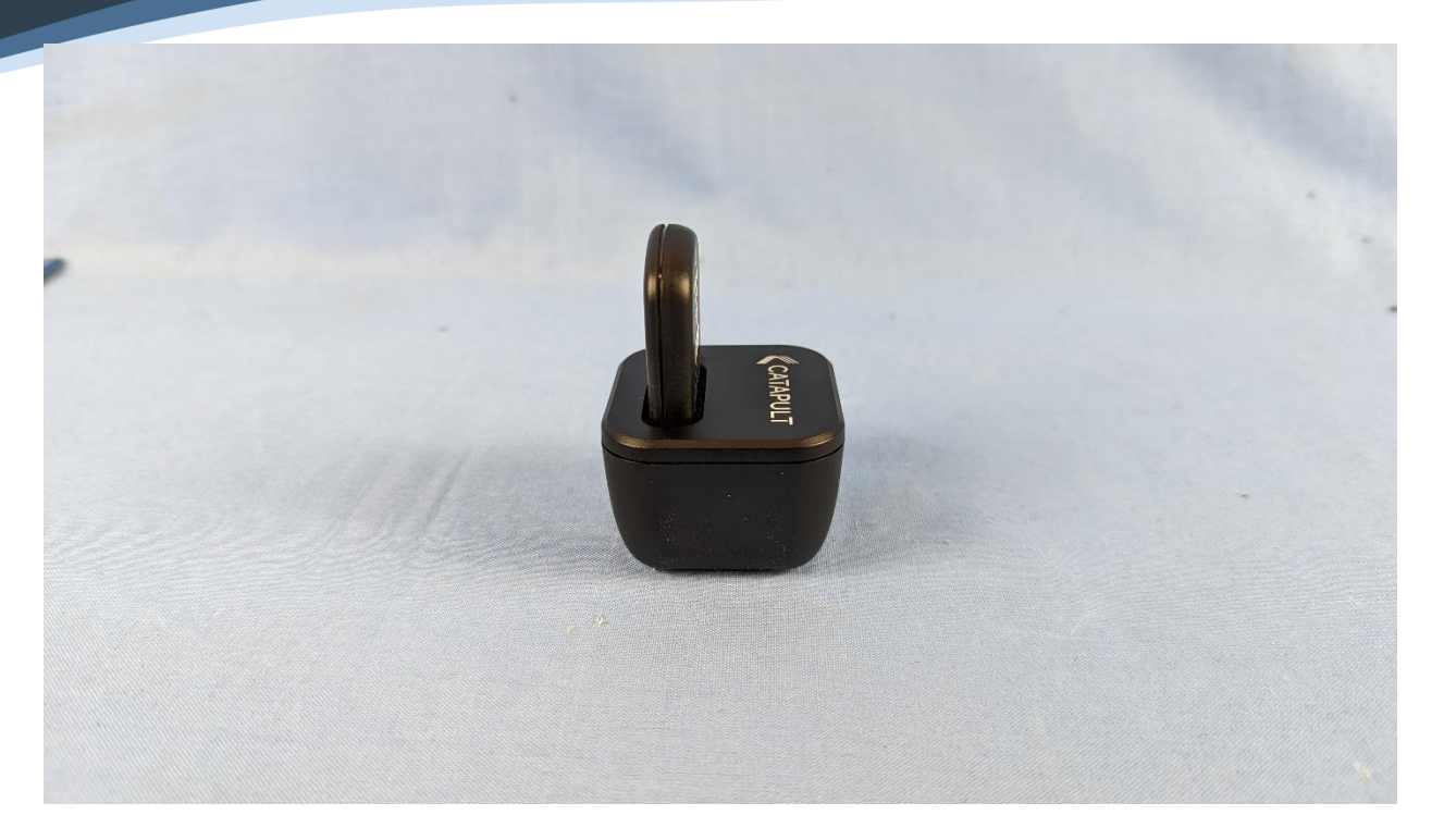
Right View in Cradle