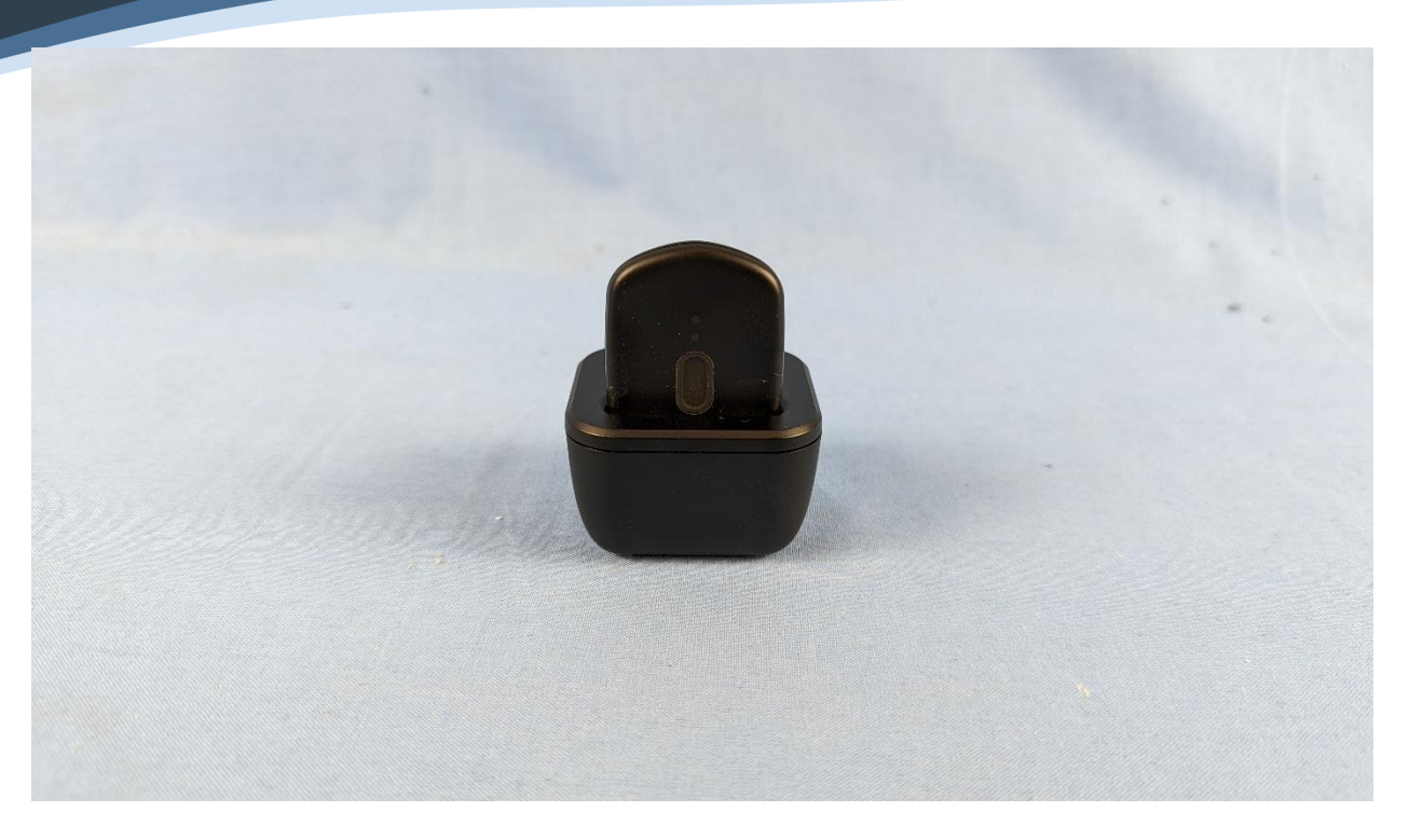
Front View in Cradle