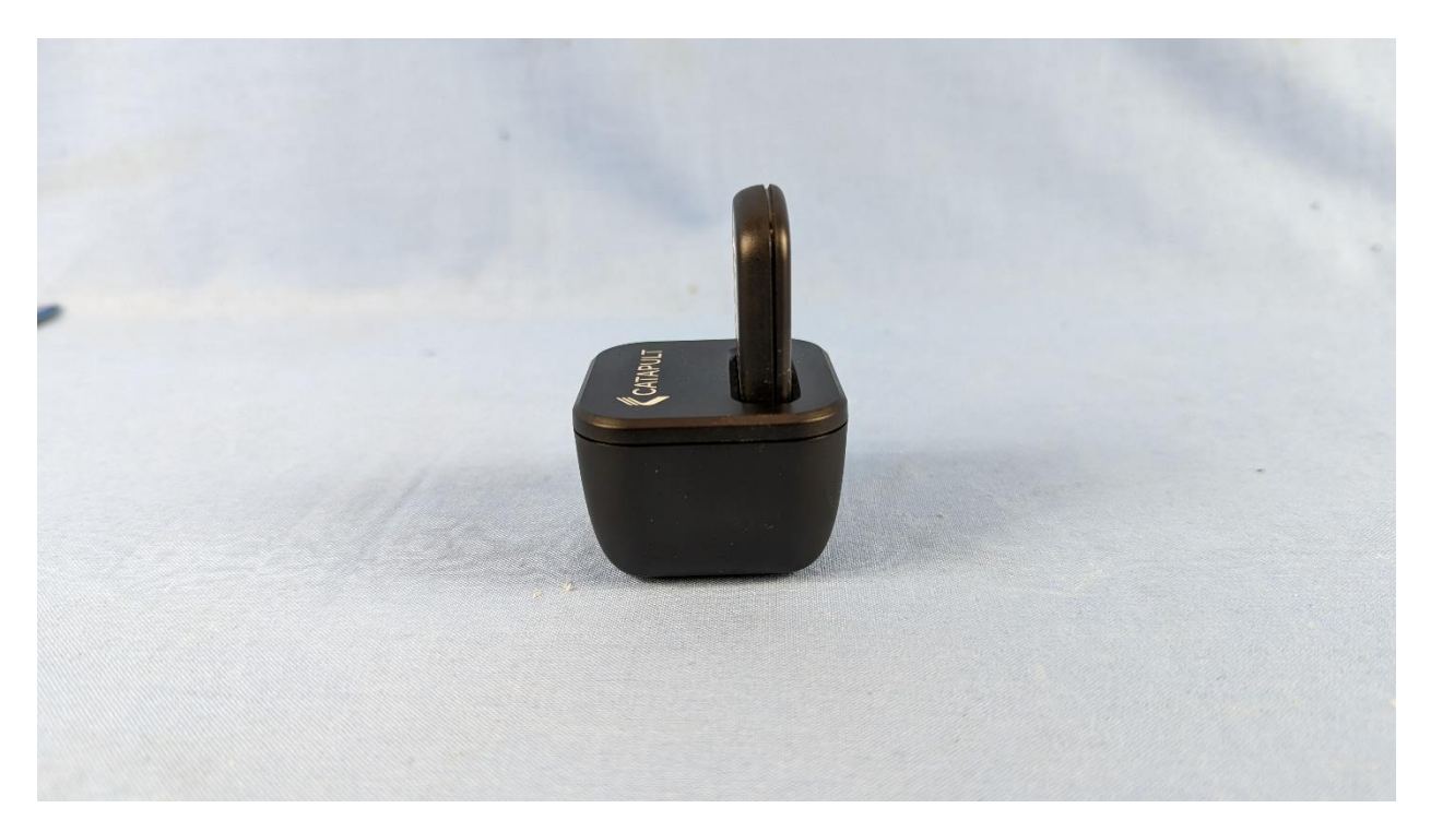
Left View in Cradle