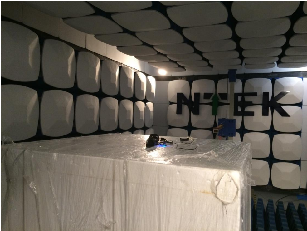
AC Conducted Measurement Photos