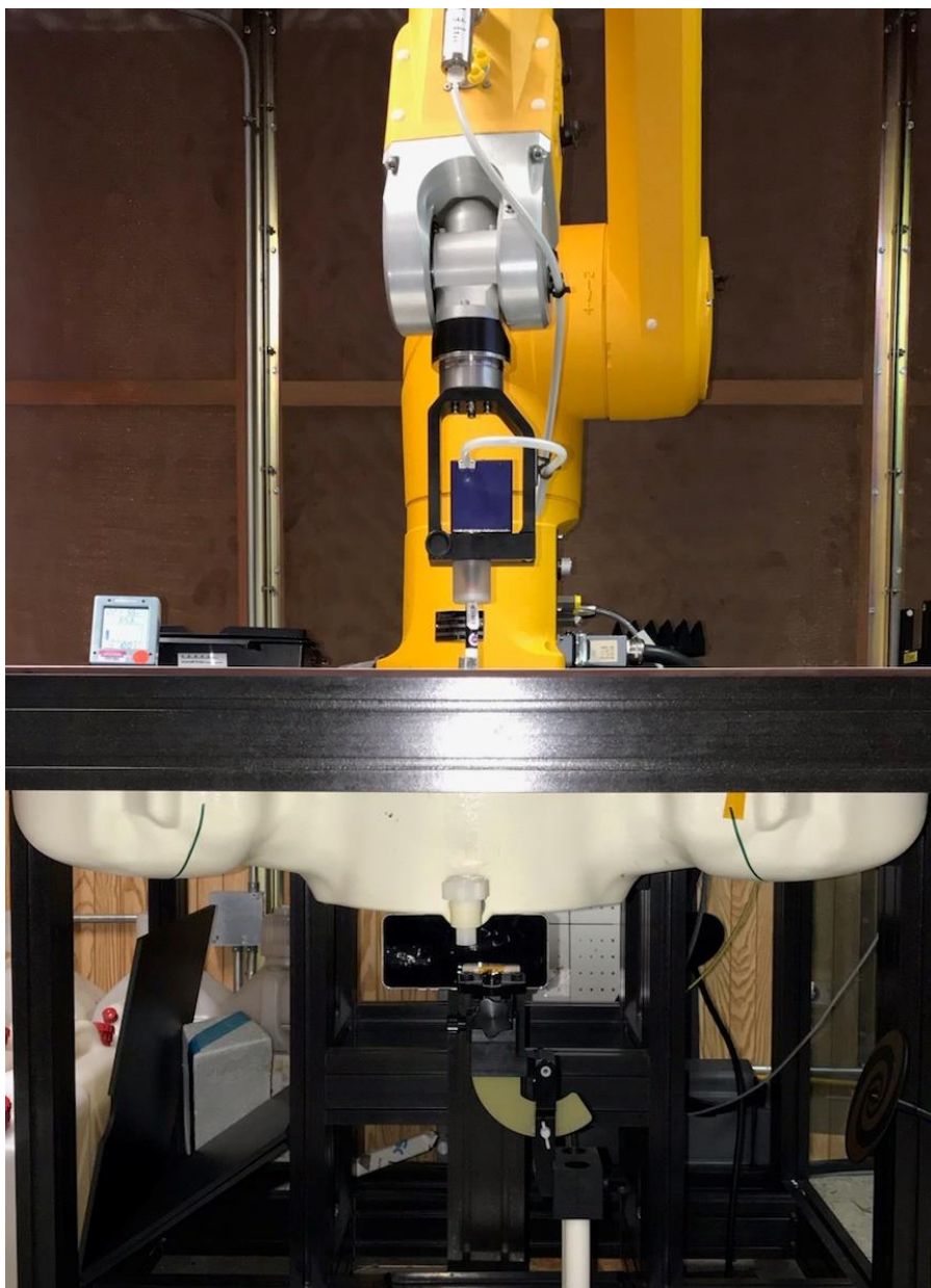
Figure 6-1 SAR measurement setup

The photo below is Figure 6-1 in Section 6.1 of Part 2 report, showing SAR measurement setup taken with actual EUT.