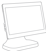
15.6" Main Display (L1571)