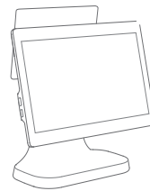
15.6" Main Display + 10.1" Customer Display (L1572)