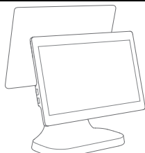
15.6" Dual-Display L1573