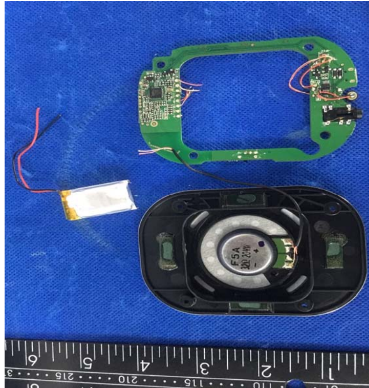
Photo 5 Appearance of PCB