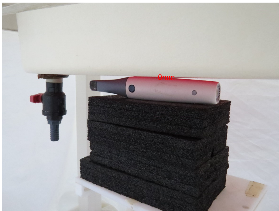
Picture 4: Right Edge, the distance from EUT to the bottom of the Phantom is 0mm