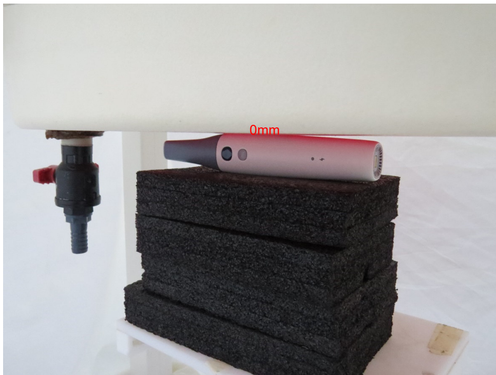
Picture 3: Left Edge, the distance from EUT to the bottom of the Phantom is 0mm