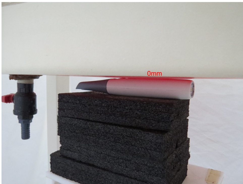
Picture 1: Back Side, the distance from EUT to the bottom of the Phantom is 0mm