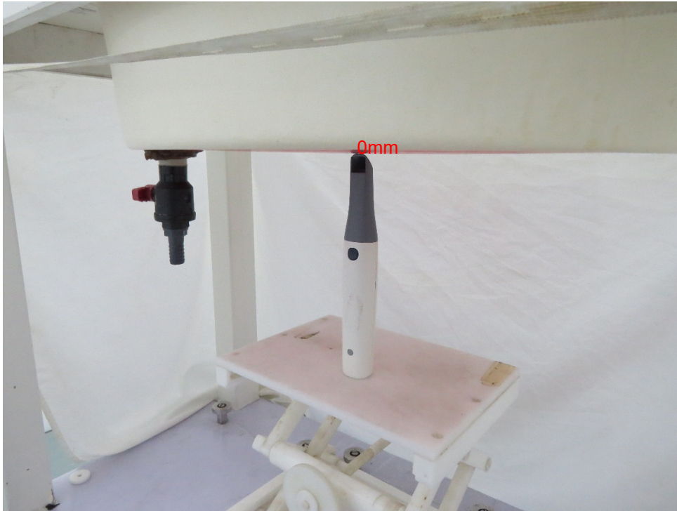
Picture 5: Top Edge, the distance from EUT to the bottom of the Phantom is 0mm