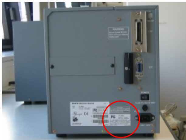
Label Position (Printer Back View)

Material: Matt Silver Polyester (Thickness: 0.05mm), on Laminate Adhesive: Hot melt pressure sensitive adhesives, or Synthetic resin emulsion