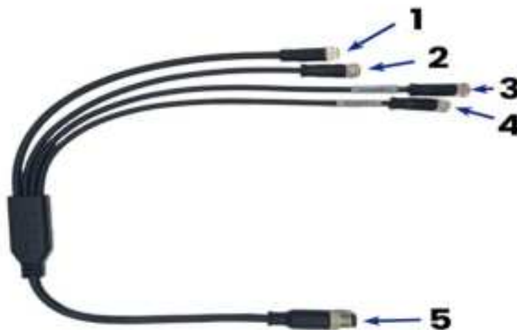
Wireharness 4PH with with Sensor 1 and Sensor 2 labeled.

The wireharness threads onto the M12 - 8pin connector. The wireharness has 4 downstream connections: