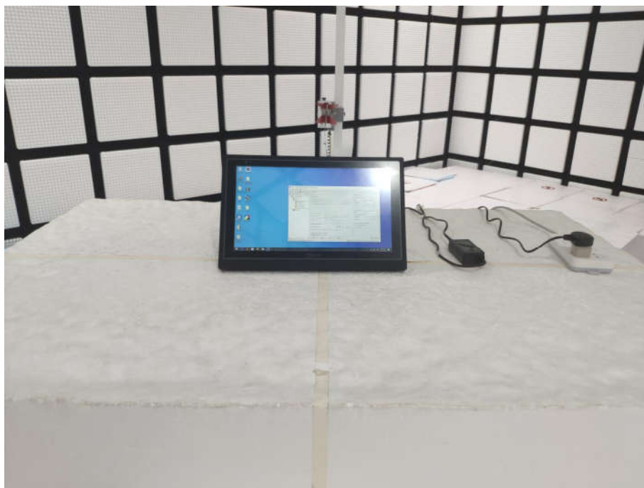
Radiated spurious emission Test Setup-3(Above 1GHz)