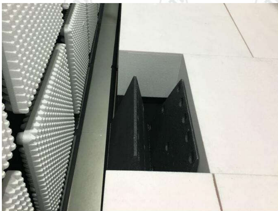
Radiated spurious emission Test Setup There are absorbing materials under the ground.