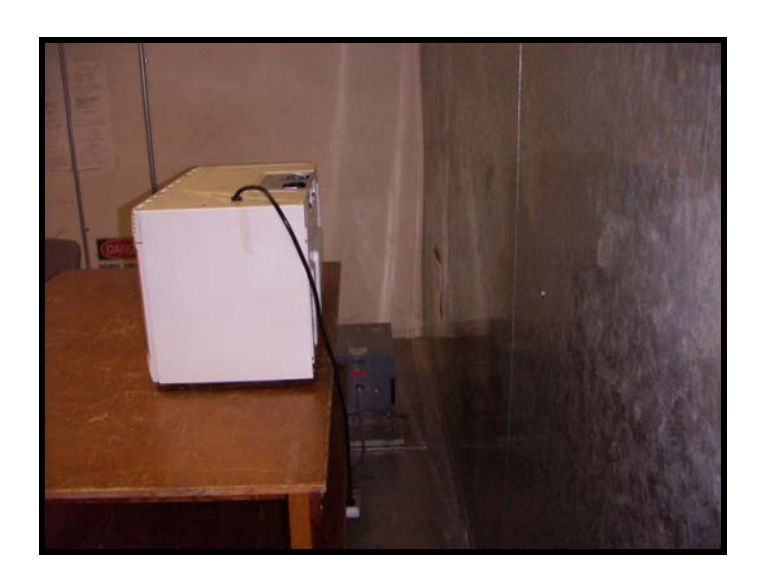
AC Line Conduction back