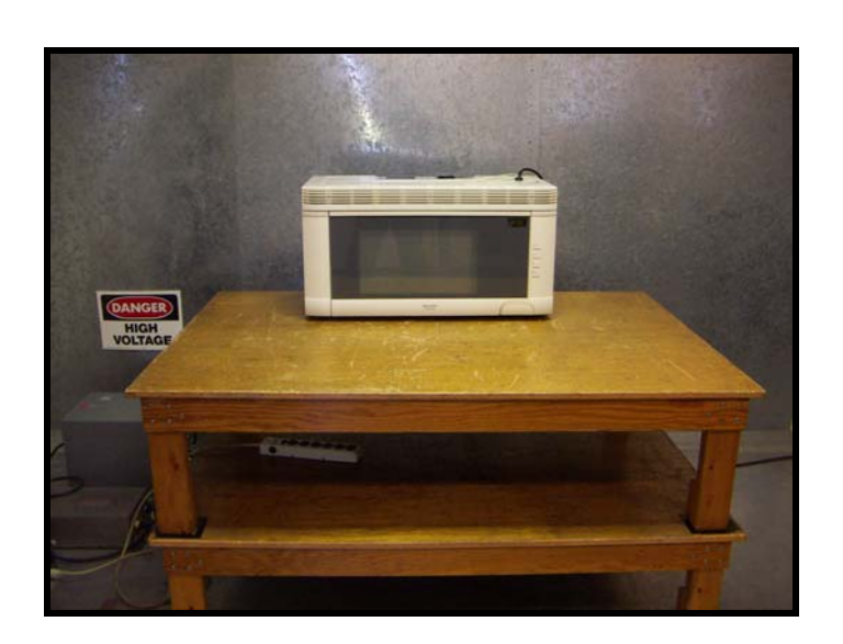
AC Line Conduction Front