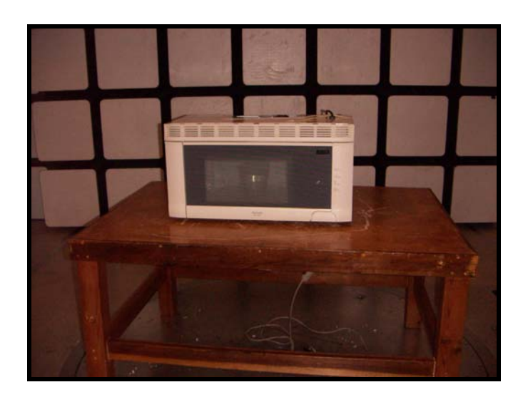
Radiation Measurement Below 1GHz