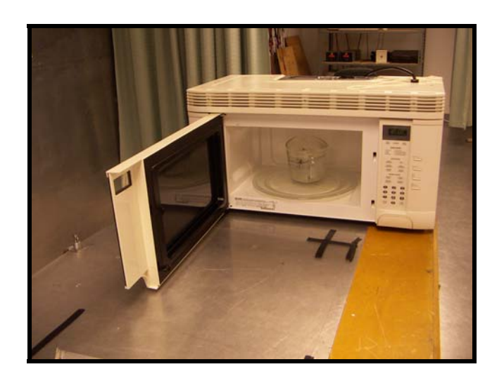
Operating Frequency Measurements