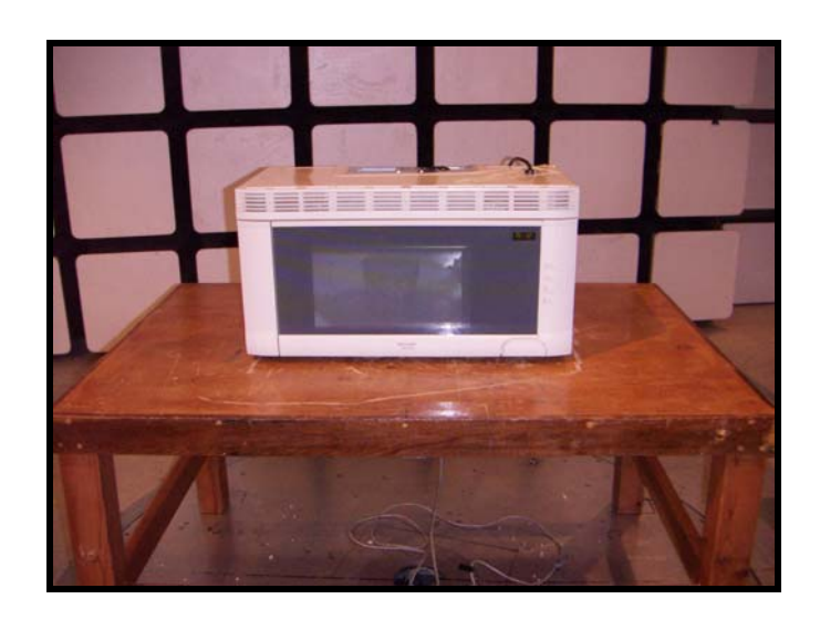
Radiation Measurements Above 1GHz