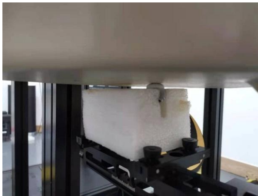
Left Bottom (0mm)