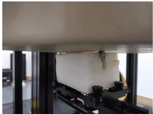
Left Front (0mm)