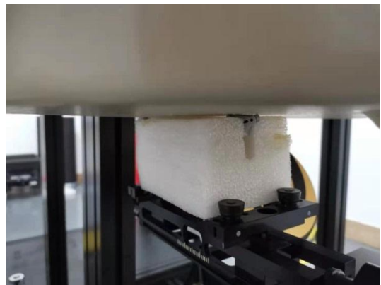
Left Touch (0mm)