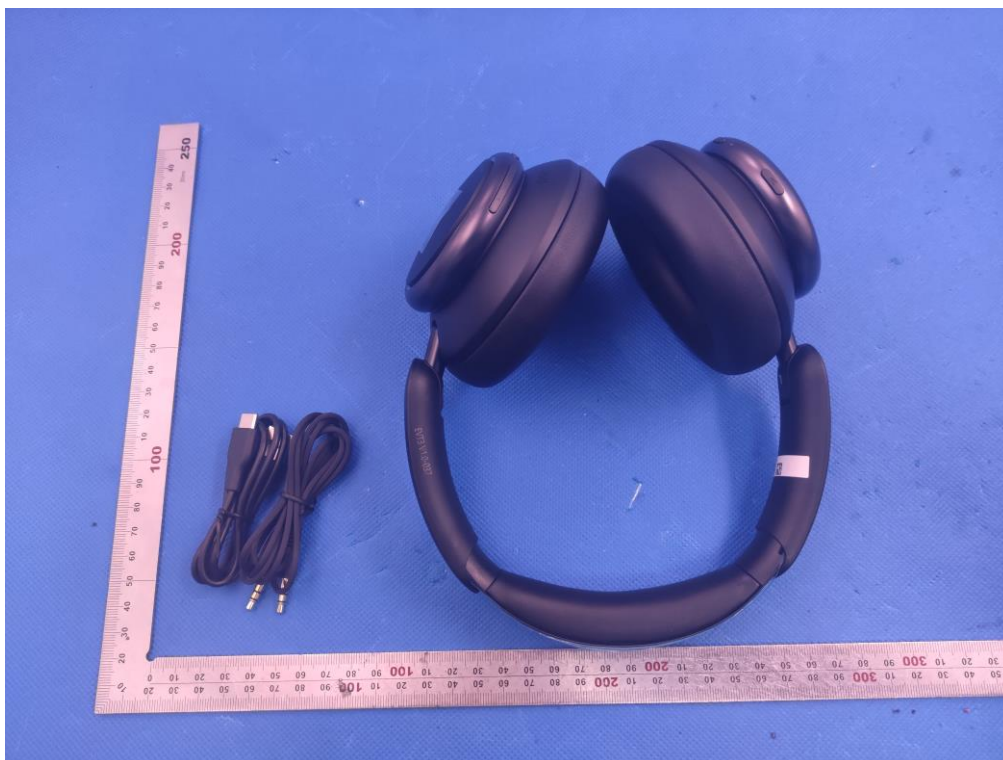
TOP VIEW OF EUT