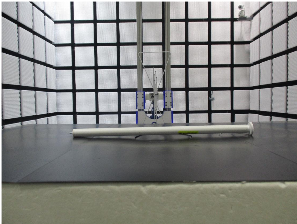
Radiated Emission Test below 1GHz