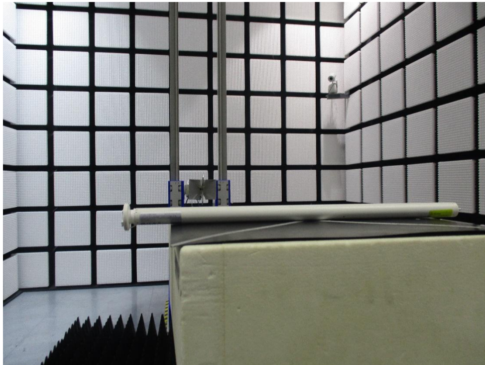
Radiated Emission Test above 1GHz