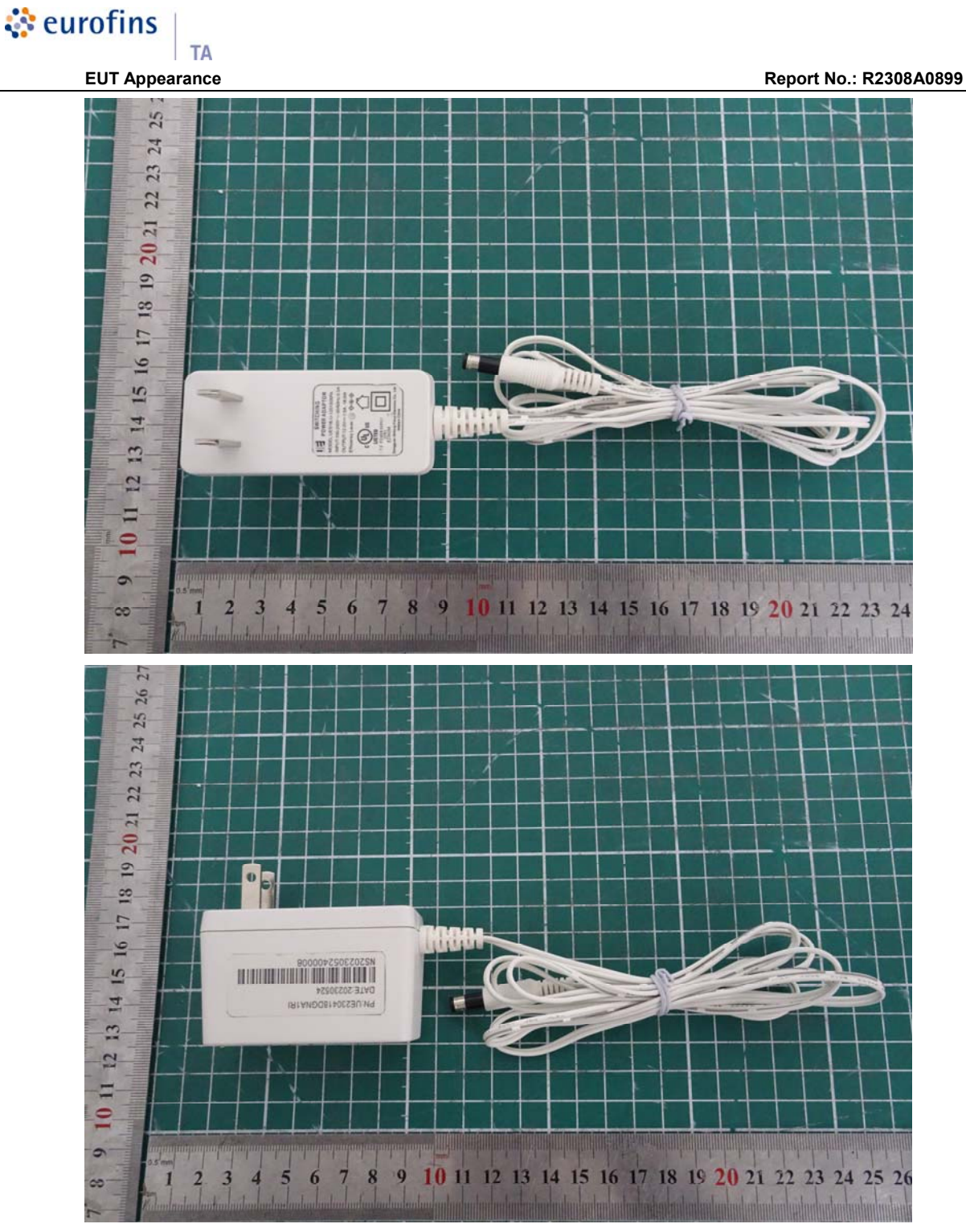
b: Adapter Picture 1: Constituents of EUT