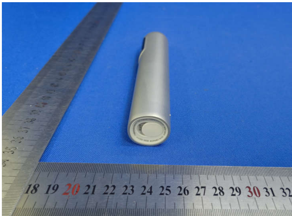
View of Product-07