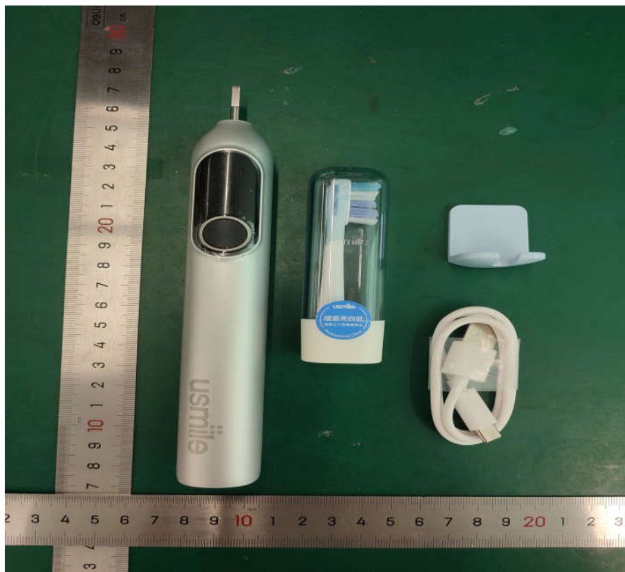
View of Product-01