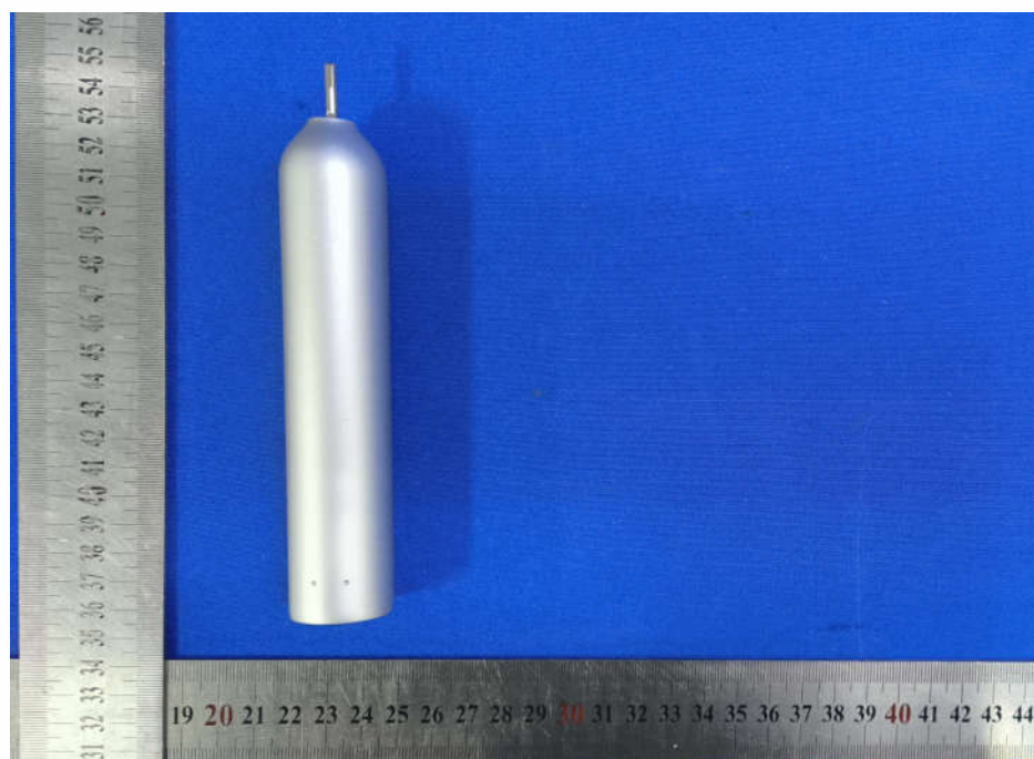
View of Product-04