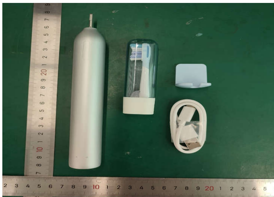
View of Product-02