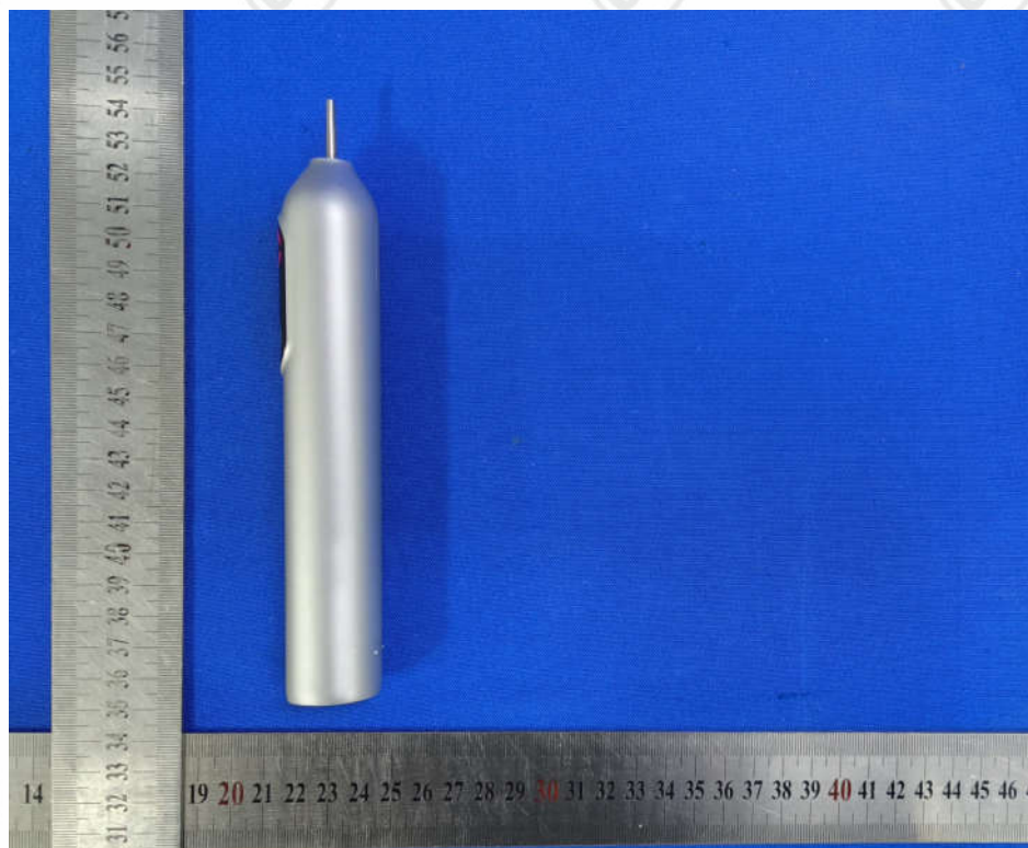
View of Product-06