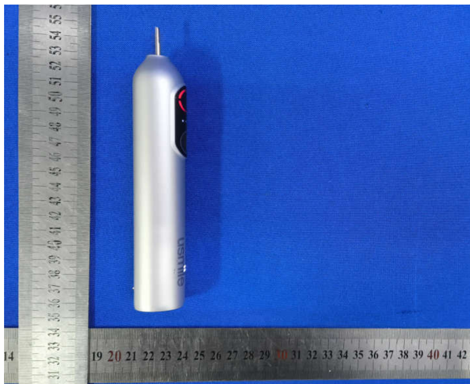
View of Product-05