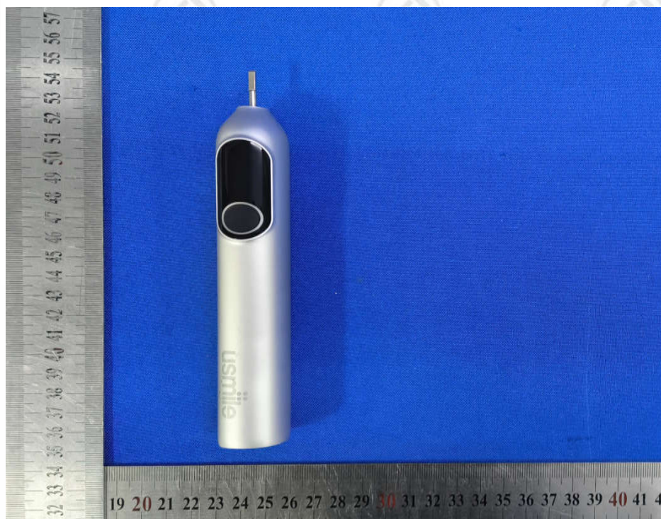
View of Product-03