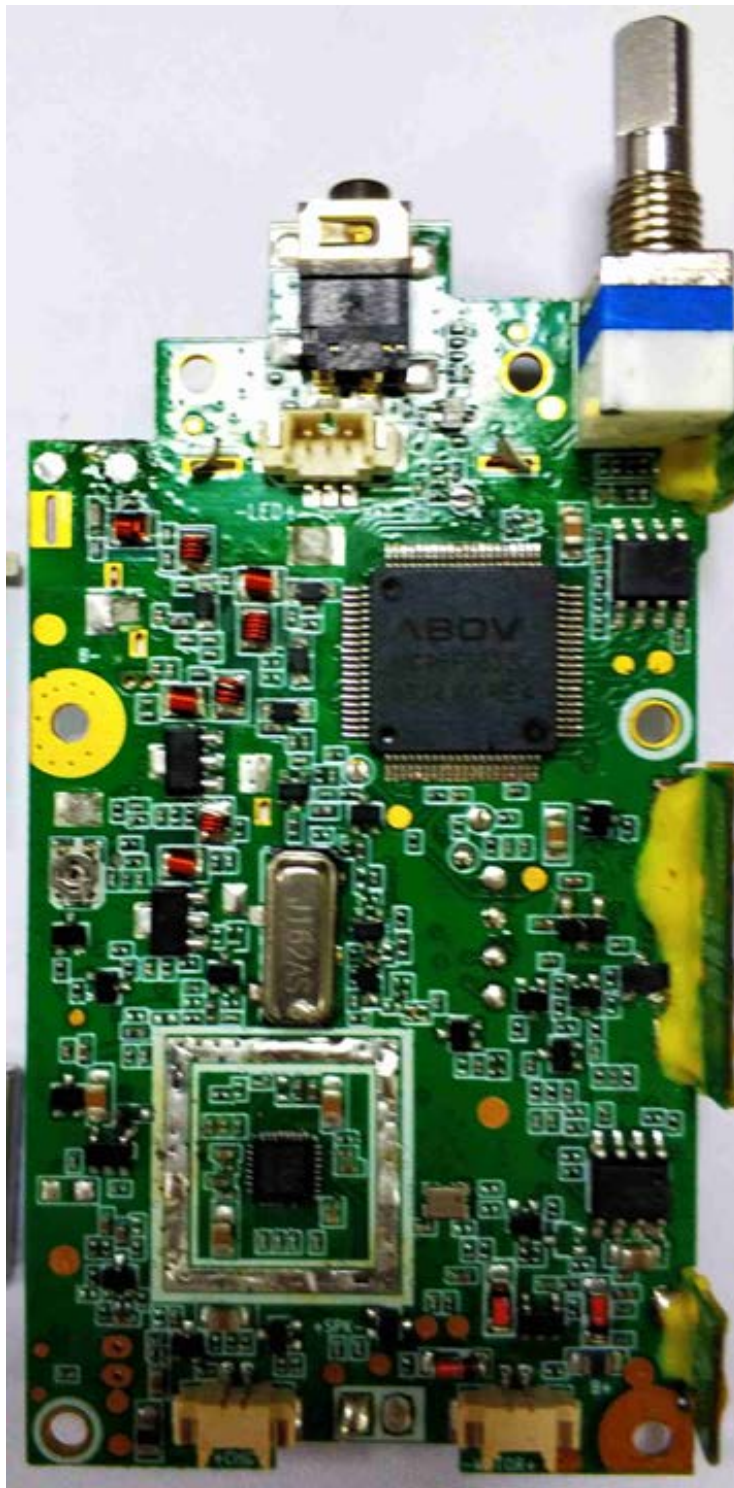
T402 / T460 / T465