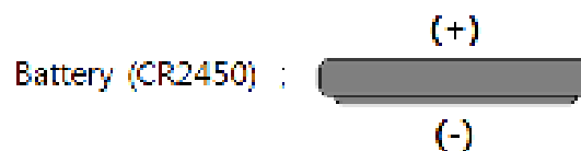
Figure 15. Battery Directional