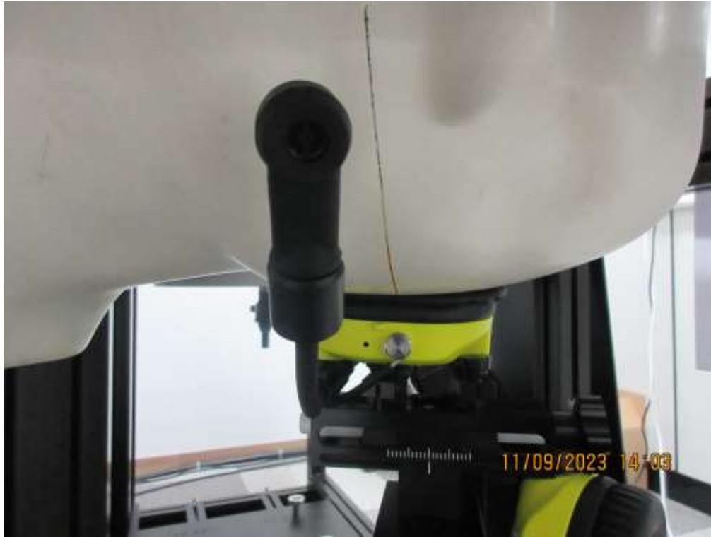
Left Ear from SAM Phantom (Separation Distance: 0 cm)