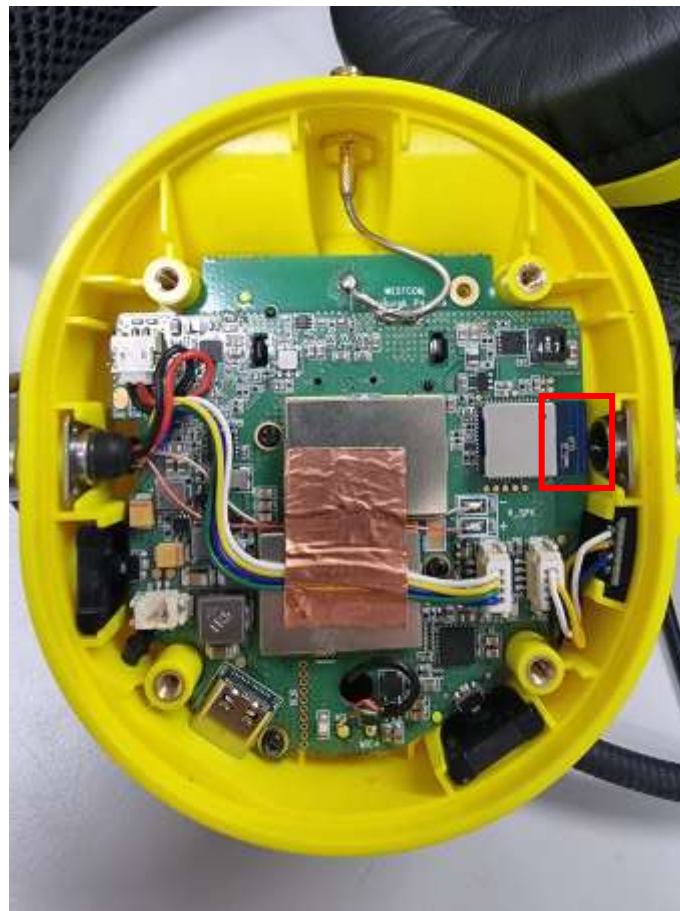
Figure F-2 Bluetooth Antenna Location

This Report is not correlated with the authentication of KOLAS.