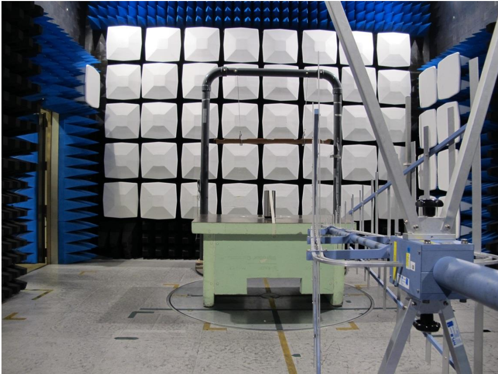
Test set up radiated emission 1 GHz – 18 GHz