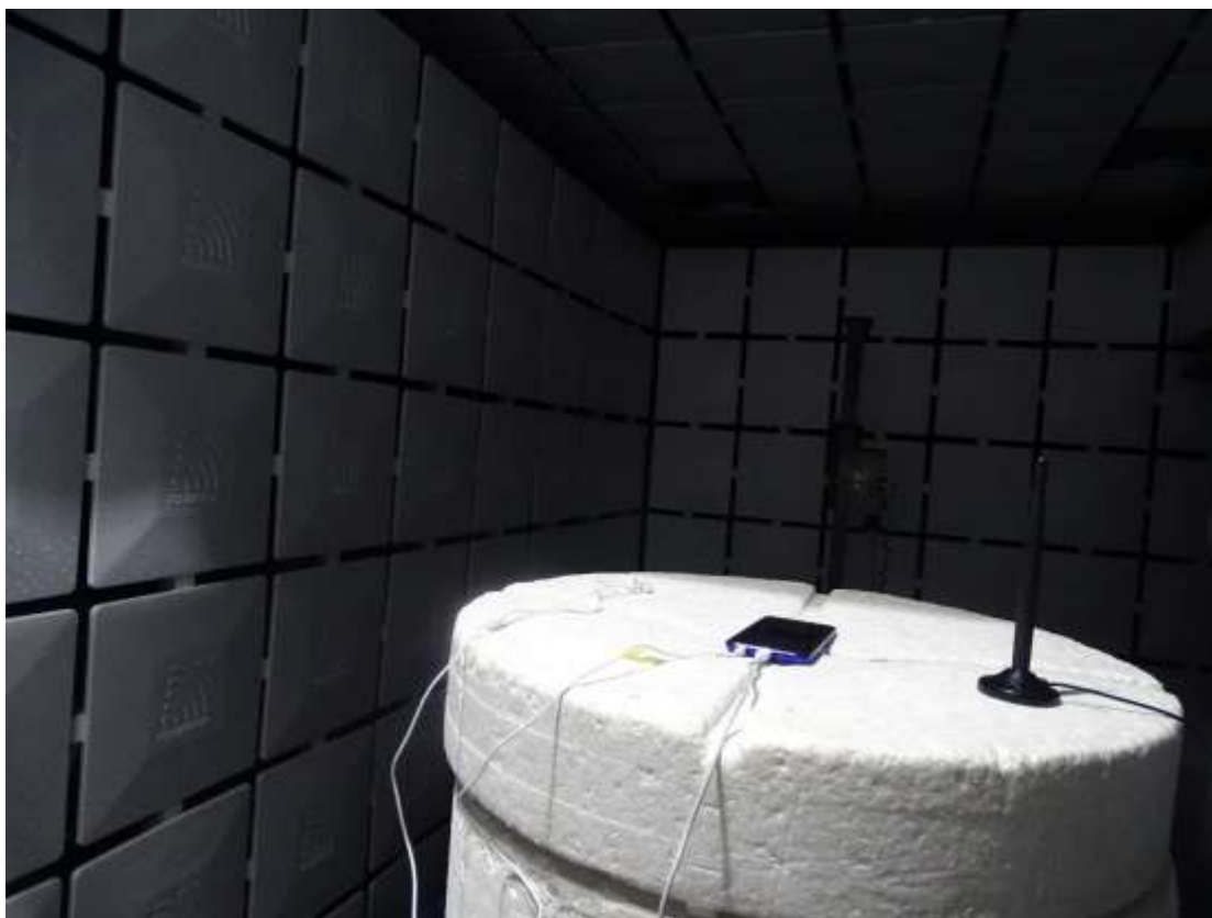
Radiated Spurious Emission (3GHz to18GHz)