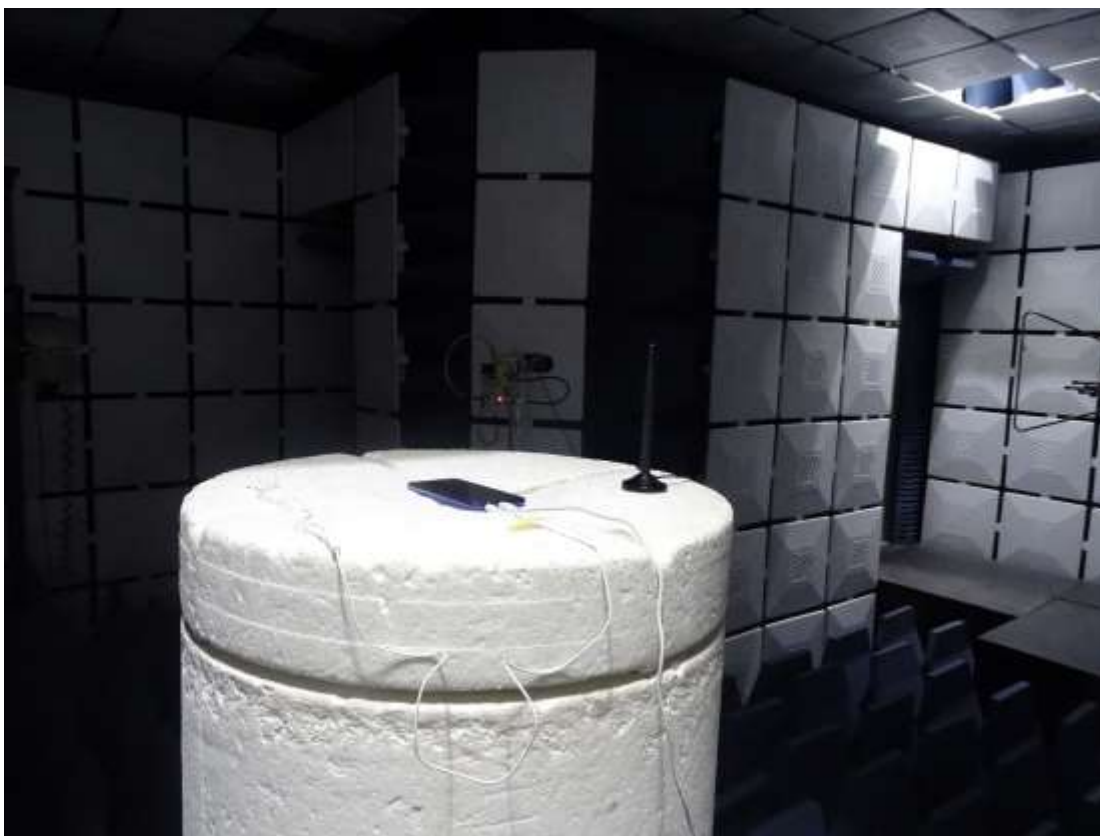
Radiated Spurious Emission (18GHz to26.5GHz)