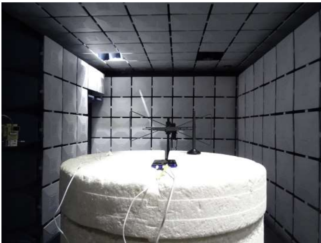
Radiated Spurious Emission (30MHz to 3GHz)