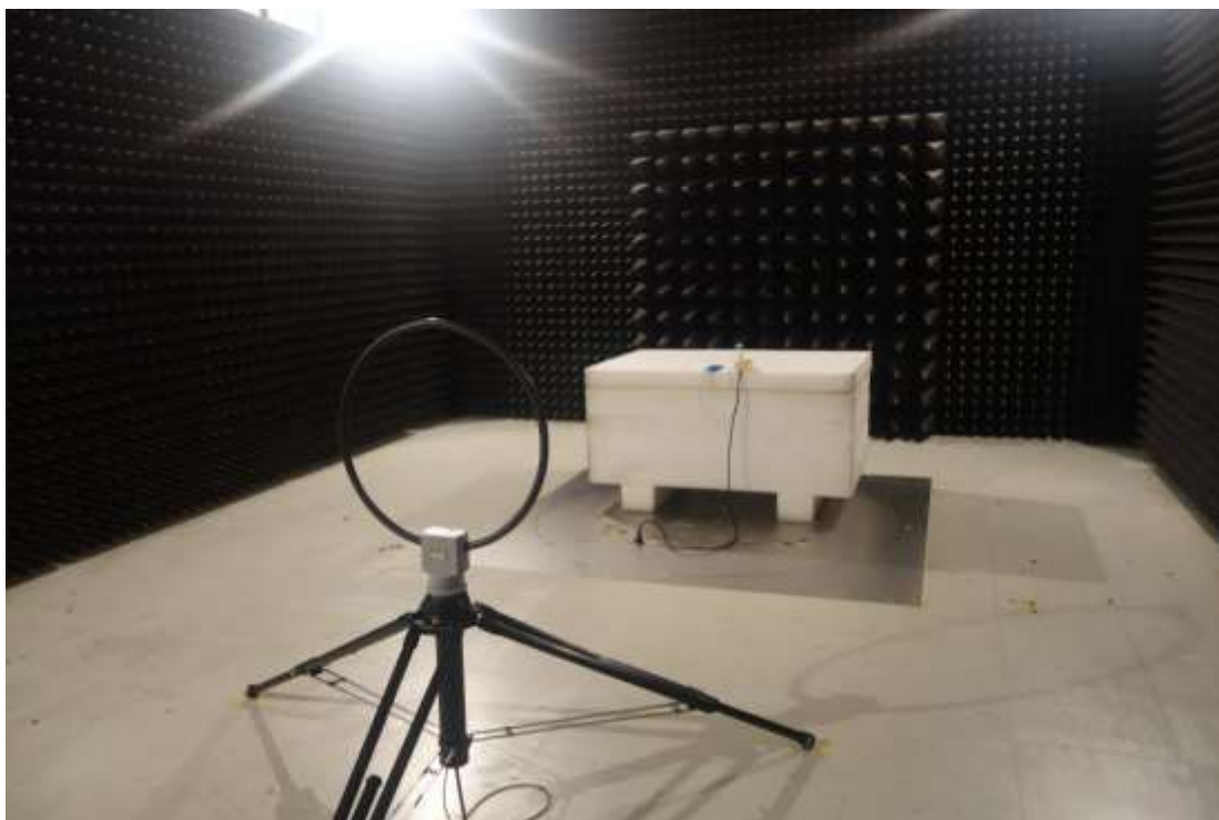
Radiated Spurious Emission (9K-30MHz)